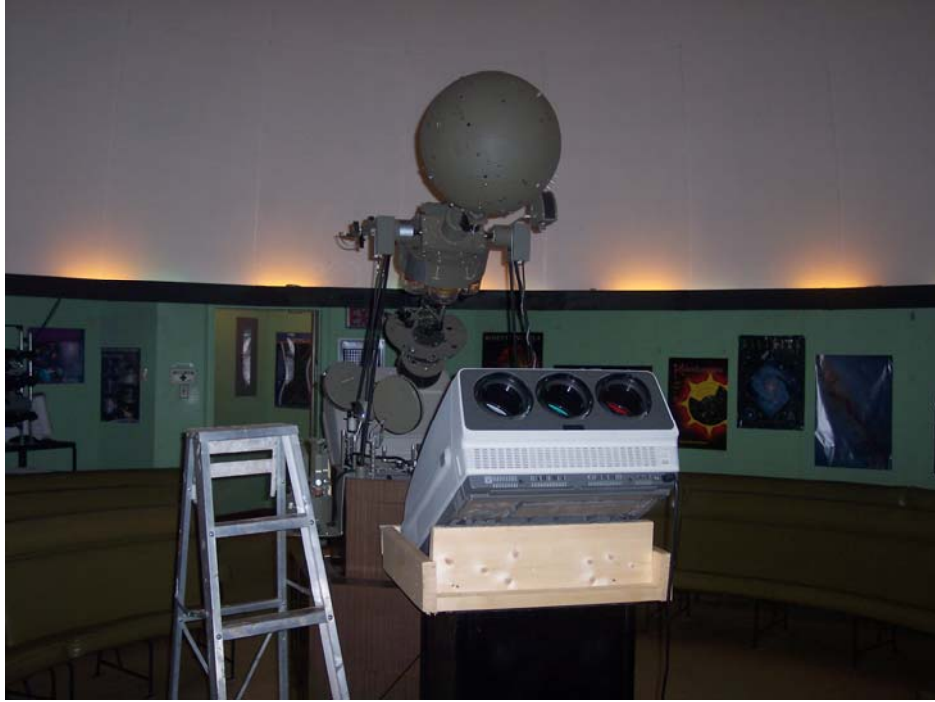
A3 – P Spitz Projector, Hatter Planetarium