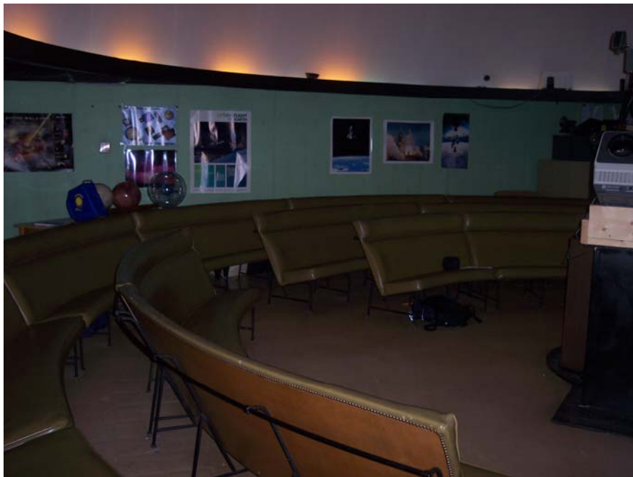
Benched Seating, Hatter Planetarium