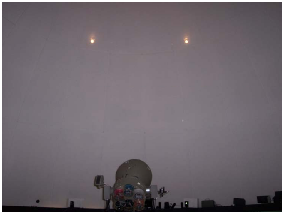
Portion of Thirty Foot Wide Dome, Hatter Planetarium