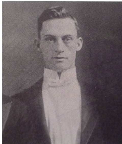
1922 Gettysburg College Spectrum, Special Collections, Gettysburg College.