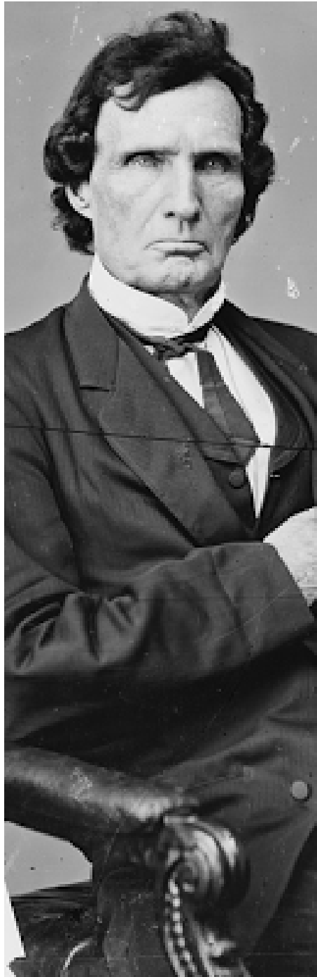
The Great Commoner, or as a good friend has taken to calling him recently: Agent K.

only served to show the men of Maryland that, "of all human beings he presents the least qualifications for a soldier."