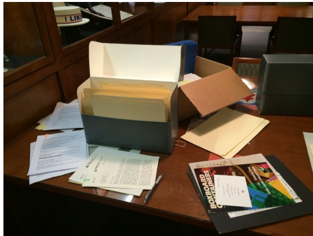
Going through the many documents and organizing them into folders.

http://blogging.musselmanlibrary.org/2015/02/