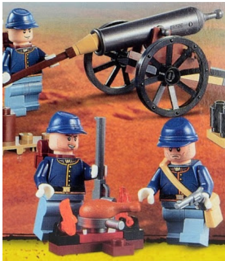
LEGO's latest Civil War dudes.

I've been waiting for this moment since 1996. Back then, when I was 11, My favorite toy came out with figures from my favorite era. The LEGO Western line was an amazing crossover of my love for history and my love for tiny ABS building blocks.