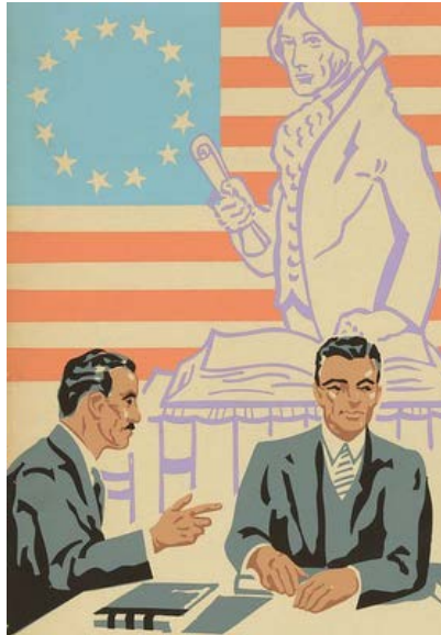
"To speak up for democracy..."

We do get to set the rules of the debate in our forums. On our blogs, that means we can ask commenters to be civil, and some of us go as far as to choose not to host comments we find