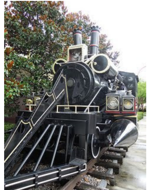
"Marty! It runs on steam!"

Sometimes we historians fixate on a particular target in that Fourth Dimension, unable to take our eyes off of it. It rushes at us like a horde of cartoon indians on the back wall of a derelict drive-in movie theatre: