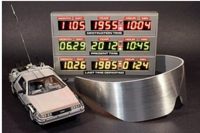
"No wonder this circuit failed. It says 'Made in Japan.'"

Young Doc: "Marty, you're not thinking fourth dimensionally. You'll instantly be transported back into 1885, and those Indians won't even be there."