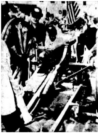
Reenactors on 22 April 1961 manning a cannon in salute of the "Independent Blues"

In 1961, Gettysburg played host to a kick-off event for the Civil War Centennial. The town commemorated the sendoff of the Independent Blues, a militia company which marched off to war in the aftermath of the firing on Fort Sumter. The affair was huge. The Diamond was closed off to traffic as actors in old time clothes strutted through a political rally on the square. Spectators watched from the sidewalks as speakers mounted a wagon and gesticulated wildly at the crowd. Gettysburg College's students, wielding trumpet and drum as they did for Football games on Nixon Field, stood in for the town's 1861 marching band.