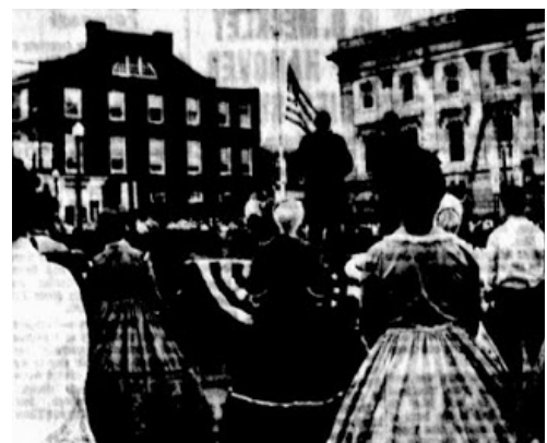
"Civilians" look on as Gettysburg's "politicians" pledge support of Lincoln's government

Fast forward fifty years. This April, the Gettysburg