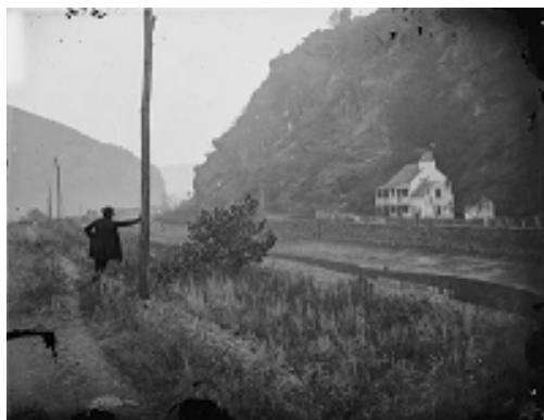
The Baltimore and Ohio Railroad opposite Harpers Ferry