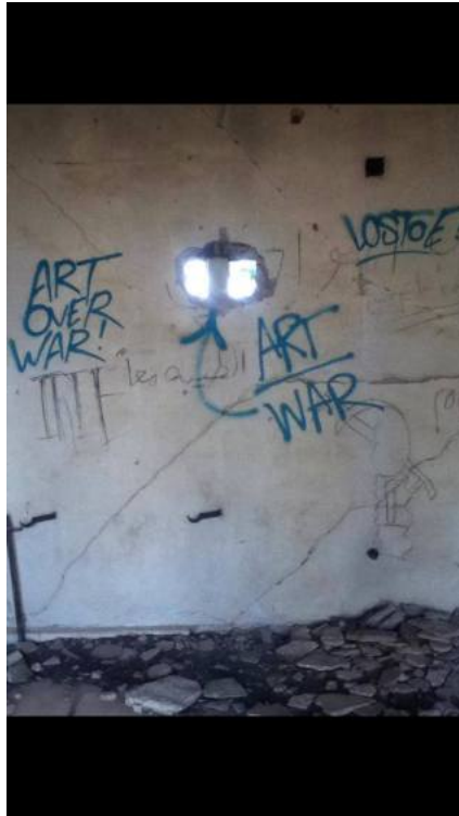
The wall of an abandoned hospital on the Syrian-Israeli border.

Last summer, while on a trip with the Eisenhower Institute's Inside the Middle East program , I stood at the Israeli edge of the Golan Heights and heard a bomb explode across the border in Syria. We had spent the day within several miles of the war-ravaged nation with all remaining quiet until that moment, and while none of us wanted to admit it, we had the smallest hope that we might catch a glimpse of the conflict. However, when the sound of the detonation roared across the hills, excitement was replaced by a sense of fear and grief. I had lived a year in Gettysburg, yet I had never felt so close to a battlefield.