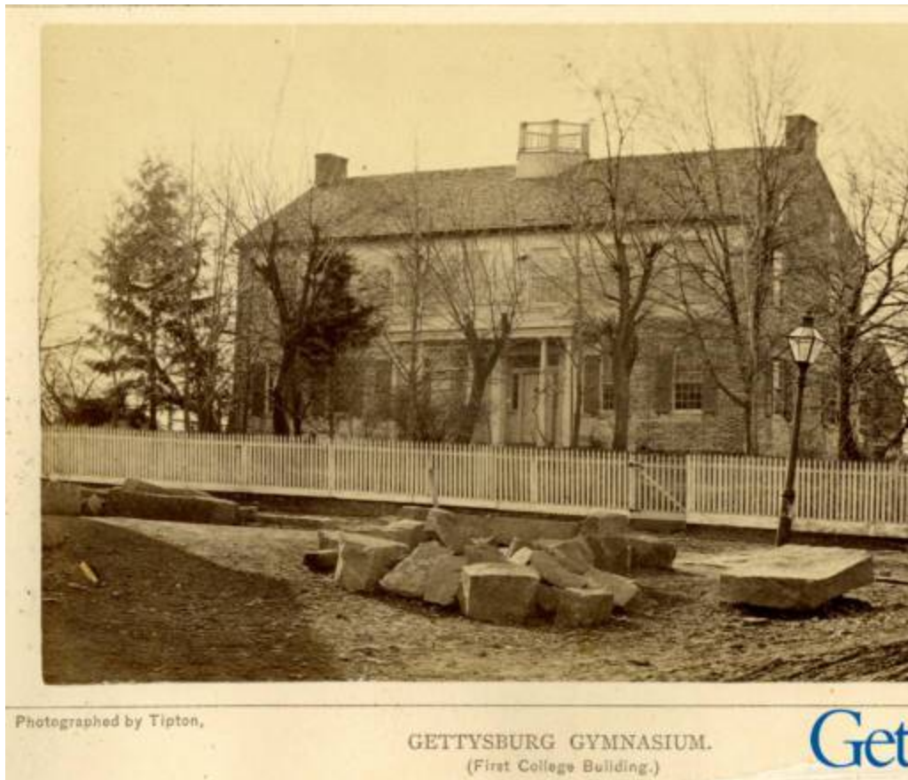
Gettysburg Gymnasium at Washington and Carlisle Streets, ca. 1882.