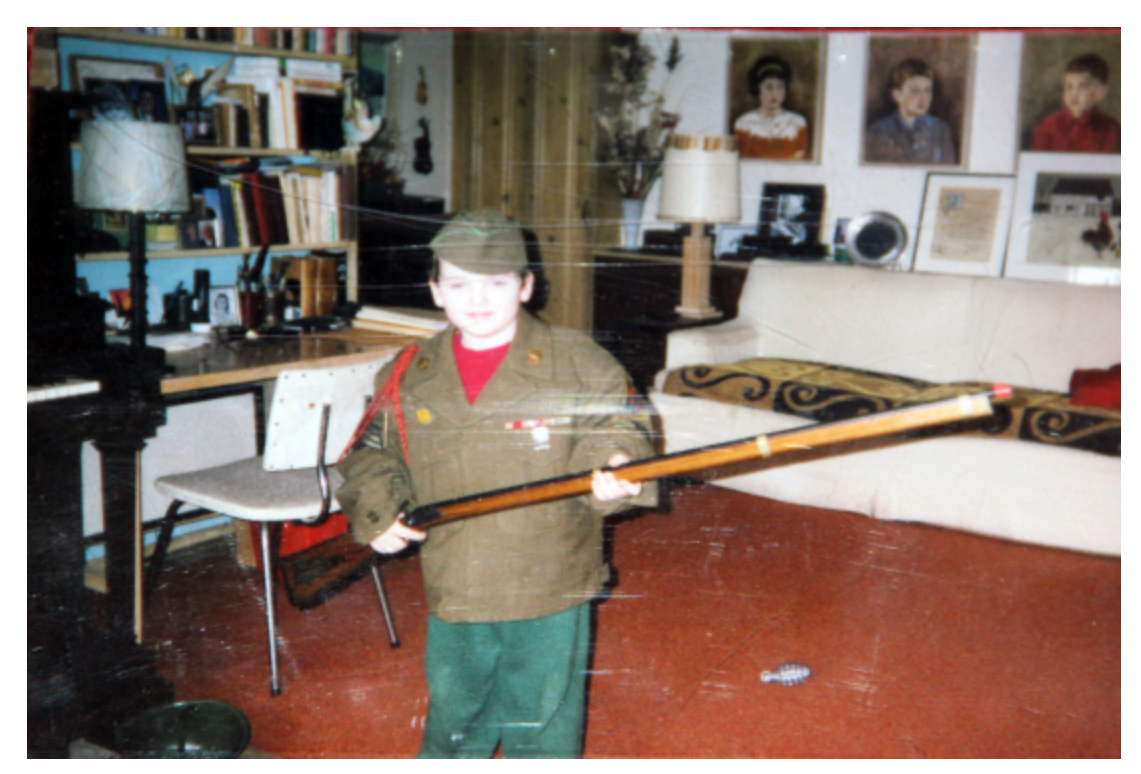
The author as a child.

Sadly, we still suffer from this all-too-human tendency to jump at the shadows of the past, to let our nightmares fill in the gaps in our knowledge. Too often in recent years we have found ourselves lead around by the nose, ceaselessly rounding a circle of blood and woe that stops us from believing that people can ever make peace and mean it. But we must remember that people can change. Eighty million Germans did; my grandfather got to see that change before he died. He traveled a Europe at peace, wearing a suit in place of his uniform. He carried a canvas instead of a carbine. And he was glad of it. He never once spoke ill of his former enemies to me. He knew all too well the horrors he witnessed, and, I sense, that because of that sad knowledge, he knew that such horror must be consigned to history, even if that meant him placing an immense amount of faith in strangers.