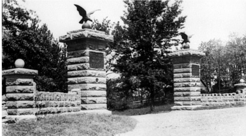
Gettysburg battlefield Taneytown road entrance c. 1896/1900.