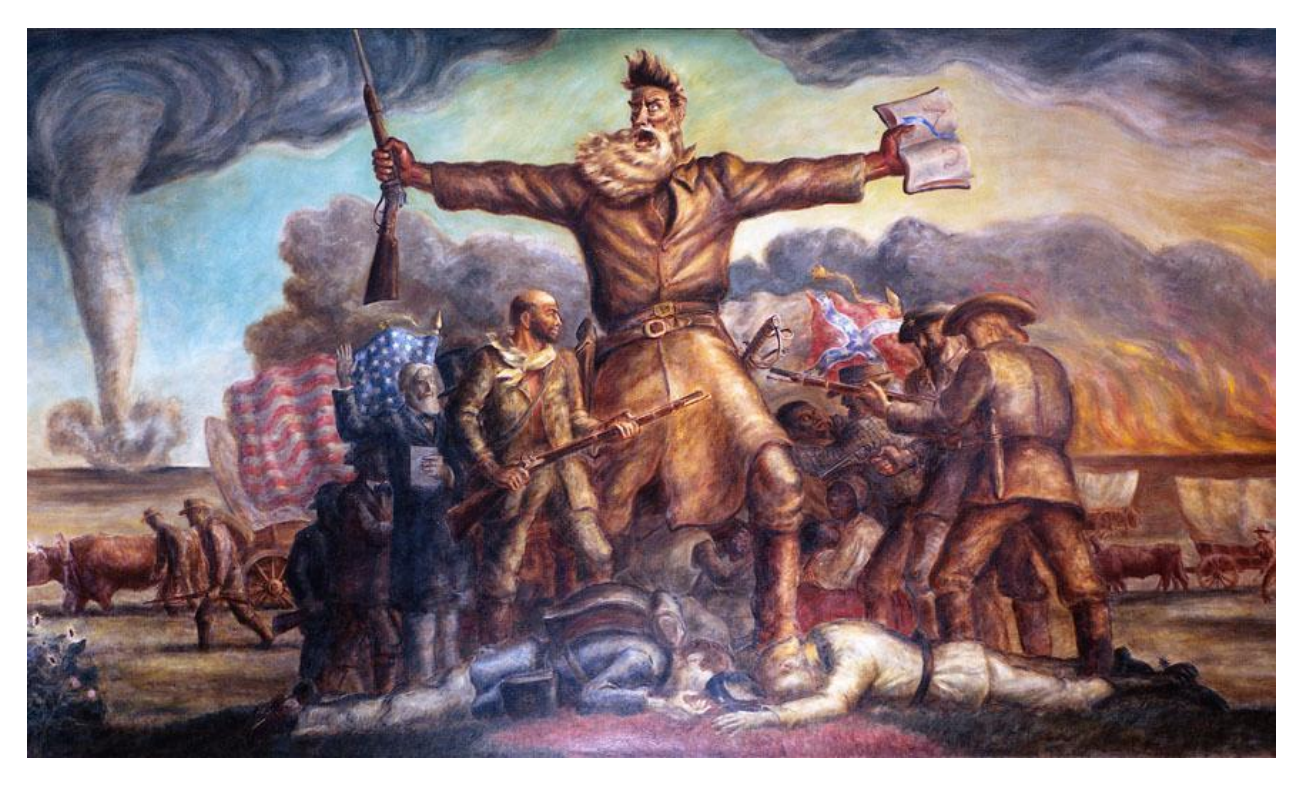
Tragic Prelude (1940) by John Steuart Curry. Located in the east wing of the 2nd floor rotunda in the Kansas State Capitol Building.

Perhaps you have, and perhaps you've already thought a bit about him and what he represents to you. But if you have not, take a moment and just look at him, and consider the question I have raised. What emotions does this painting, showing a man towering over other figures and a landscape like a god stir up in you?