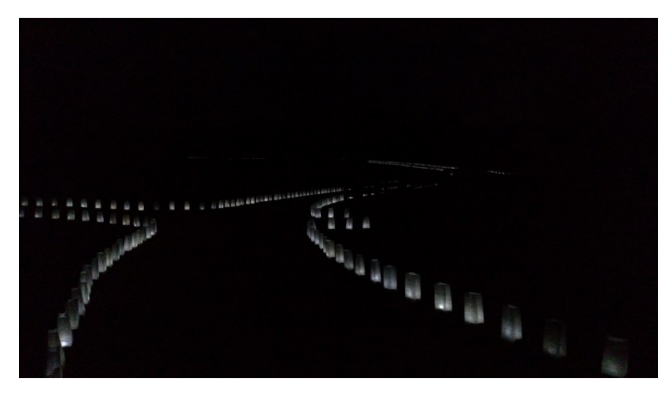
After the sun had set, the luminaries were nearly the only source of light in the park. Only the full moon, occasional camera flashes, and campfires lit the night. Proceeding into the distance past ridges and hills, the lights went on and on.

The 152<sup>nd</sup> took that form of commemoration even further. The paper bags holding the luminaries had the names of over 3,800 of the slaves written on them. Taken from the In addition to this physical grouping by name, a list of the names was also read aloud at a podium several times throughout the day. Some of the men and women who read those names were descendants of the emancipated slaves. As the afternoon continued, the 4,600 bags were placed along the Richmond-Lynchburg Stage Road that runs through the park. Inside each was a batterypowered white tea light that flickered when turned on. As the sun set, the temperature plummeted, and the scene was absolutely stunning. The flickering lights along the road offered nearly the only light in the village, and the smoke and glow from the reenactors' campfires enhanced the scene. The lights illuminated the paths to buildings you could hardly see, and they continued off into the distance and over a ridge in a way that made it seem as if they went on forever. Immersed the beauty, it was simultaneously important to realize what each light meant. These lights that seemed to carry on without end signified how the number of enslaved people within Appomattox County also seemed to go on forever. It was an incredibly humbling experience both to guide visitors through the park on a momentous anniversary as well as to witness the beauty and weight of these powerful luminaries.