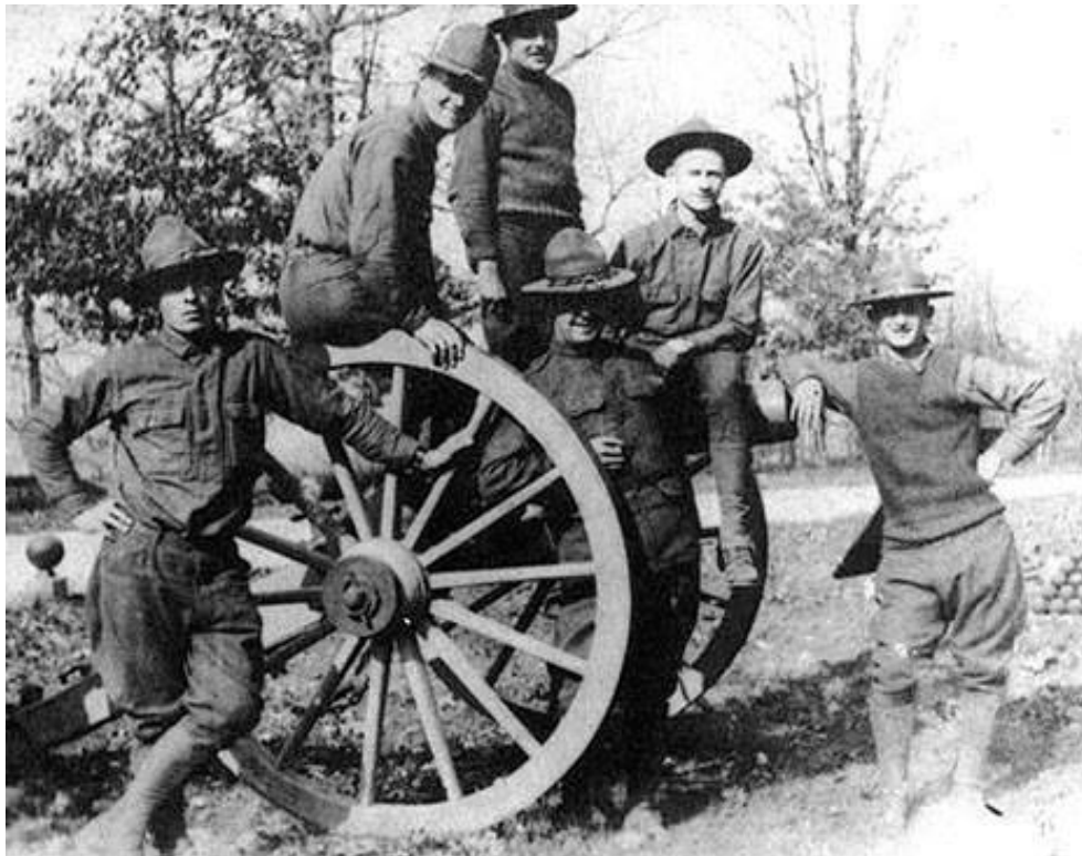
During World War I, Gettysburg was home to Camp Colt, which operated as a training camp for the army's new tank units.

Inhabitants of Adams County found ways other than military service to assist the nation. During the war, the government raised funds through five Liberty Loan drives. The sale of loans allowed governments to offset the cost of war. The most notable outburst of patriotism was the Third Liberty Loan, launched in April 1918. Although many districts did not meet their goal, the county quota of $1,069,530 was exceeded when county residents raised $1,392,650. Gettysburg alone raised $479,000, while its quota was merely $275,110. Over 18% of the county participated in the Third Loan alone. In total, the county raised $5,107,500, surpassing their quota of $5,061,400.