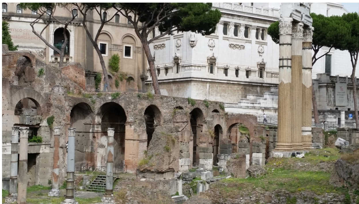
Largo Argentina . Site excavated by the Fascists.