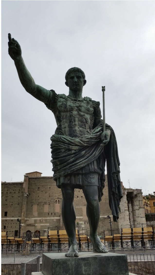
Statue of Augustus. Re-casted in Bronze by Mussolini. Rome, Italy.