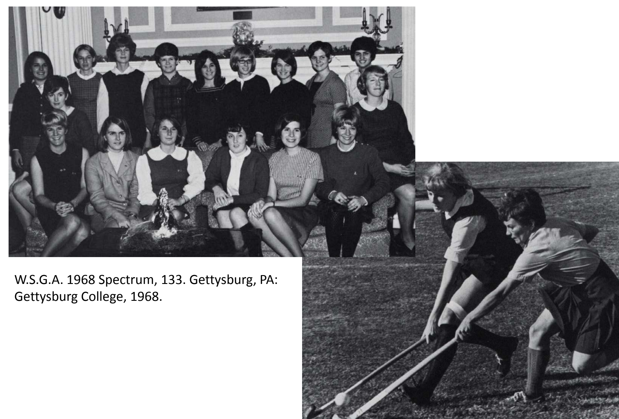
W.S.G.A. 1968 Spectrum, 133. Gettysburg, PA: Gettysburg College, 1968.

The goal of the project was to understand the experiences of Women at Gettysburg College from 1965-1975. All areas of student life were examined: academics, activities, Greek Life, clubs, athletics and residence life.