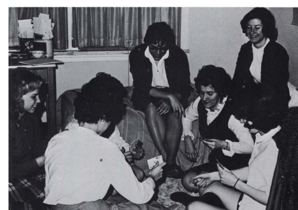
Women in the Dorm. 1965 Spectrum, 45. Gettysburg, PA: Gettysburg College, 1965.

Between the Fall of 1964 and the Spring of 1975, 2,399 women attended Gettysburg College. The number of men was 4,812. While women attended Gettysburg College, they faced discrimination in many aspects of college life. A Sleep-In was organized on March 15, 1969. This event can be viewed as a turning point for Women's Rights at Gettysburg College. During this period, Gettysburg College was relatively conservative, politically and socially. Students were affected by the changing cultural climate, but Gettysburg College was nothing like Berkeley, Columbia or Kent State.