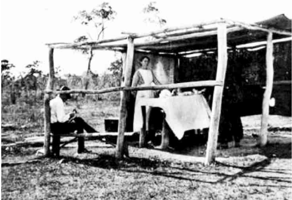
For settlers living in remote areas without neighbours nearby, the parcels of books provided by the Queensland Bush Book Club offered one of the few recreational opportunities in a life that was otherwise filled with toil and hardship.

The club is a genuine comfort to me. I get so little time to myself that I have kept the parcel nearly a year. I am sorry to have to tell you that I have to work so hard that it is very difficult to do much towards learning the children their spelling. I have so much sewing to do, making shirts and trousers for the miners and mending the bags,