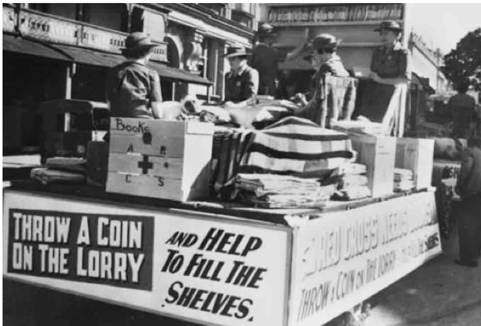
The Queensland Bush Book Club saw donations of books diminish during the war years. Books ordinarily given to the club were instead donated to organisations collecting books to send to the soldiers. The Red Cross solicited books for soldiers, as shown in this book depot float from 1944.