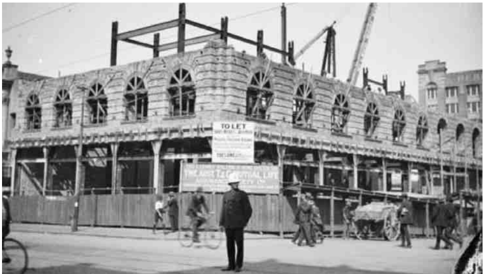
The Queensland Bush Book Club operated out of the T&G Building on Queen Street in Brisbane. This image shows the building under construction in 1923.

Deliveries to the Cape York Peninsula were especially challenging. The club considered an exchange between readers within a reasonable distance to be 50 to 100 miles. On the peninsula the nearest neighbour could be 200 miles away. In some cases, mail would come by boat to a port 50 miles away and then continue on by pack-horse. The reports from the 1950s mention deliveries by aeroplane and transport assistance from the Flying Doctor Service, but even as late as 1955 the combination of rail, motor truck and pack-horse prevailed in the Far North.