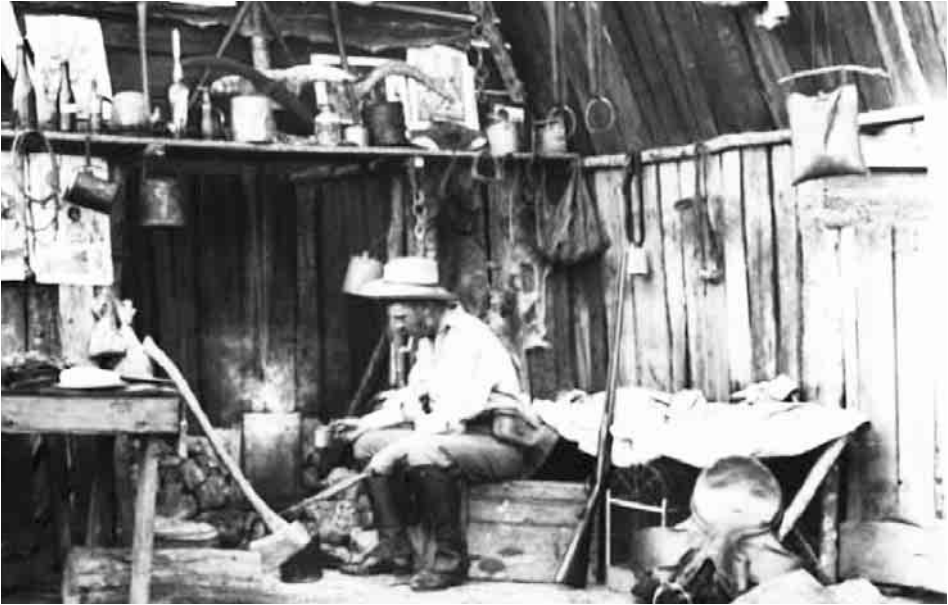
For settlers living alone, the arrival of a parcel could mean entertainment after the day's work was done. The Book Club charged a nominal fee of 2s 6d per year, which guaranteed four parcels, each with ten books and six magazines and illustrated papers.

pantry. 39 Not surprisingly, Conan Doyle, Agatha Christie and Edgar Wallace were much in demand. Ethel Dell's popular romances and Elinor Glyn's more saucy women's fiction topped the list for subscribers, who requested: 'Love stories please — because you get all the other things in real life — but not love stories.' 40 There were also readers who requested a combination: 'Please send a little bit of love for me and a murder for my old man.' 41