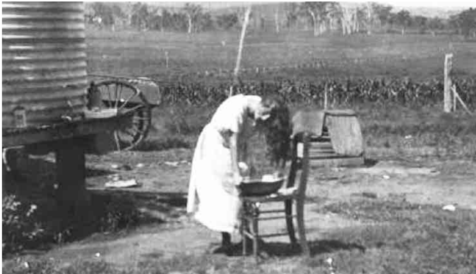
Woman washing her hair, Queensland Outback c. 1924.

Surprisingly absent from the record were appeals for practical books. One might have expected requests for books on agriculture, machine repair, livestock management, mechanics or other useful arts. Yet only one such request stands out. A boy interested in motors and engines was sent a steady supply of Popular Mechanics magazines over the years. He later wrote that he had secured a position in a country town garage and sent the club his first pay cheque in appreciation.