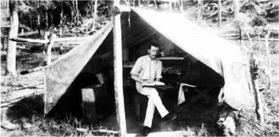
The Queensland Bush Book Club provided books and magazines to men living in mining and forestry camps as well as those working on road construction projects.

Parcels were issued from the Brisbane or Townsville centres, with a third centre later established in Ipswich. Readers passed on the books to each other through carefully mapped-out travel routes. For faster readers, the club would send additional reading matter out of cycle. The Northern and Southern District secretaries kept lists of their subscribers along each rail route, and maintained a card file in the office that listed each subscriber and their reading tastes, and recorded the books they received in order to prevent duplication.