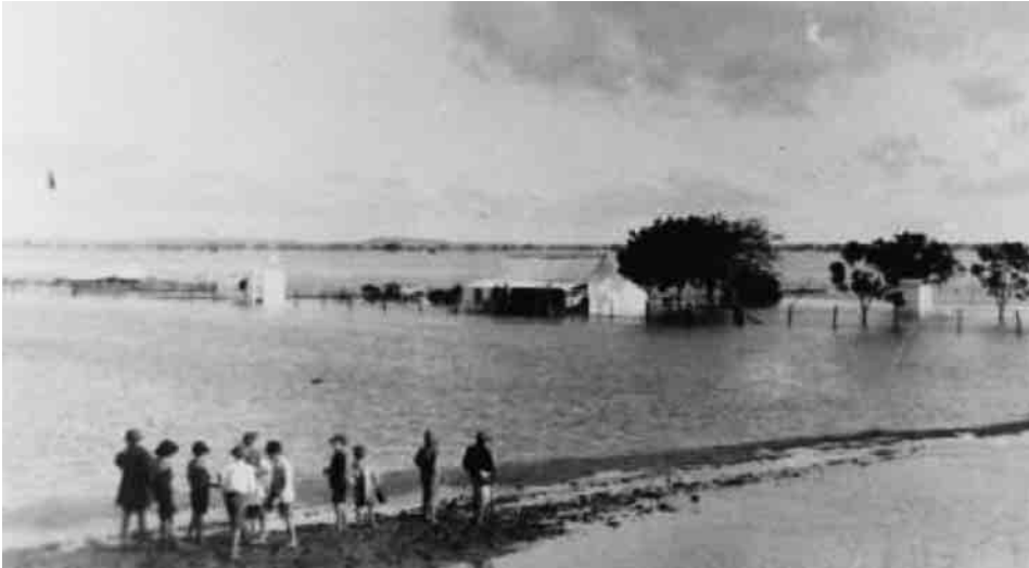
Books were one of the few pleasures in life, and often the only relief from constantly battling the elements. This image shows the Evans house and cow yard under water during the 1922 floods in Central Queensland. Winton was a community served by the Bush Book Club.