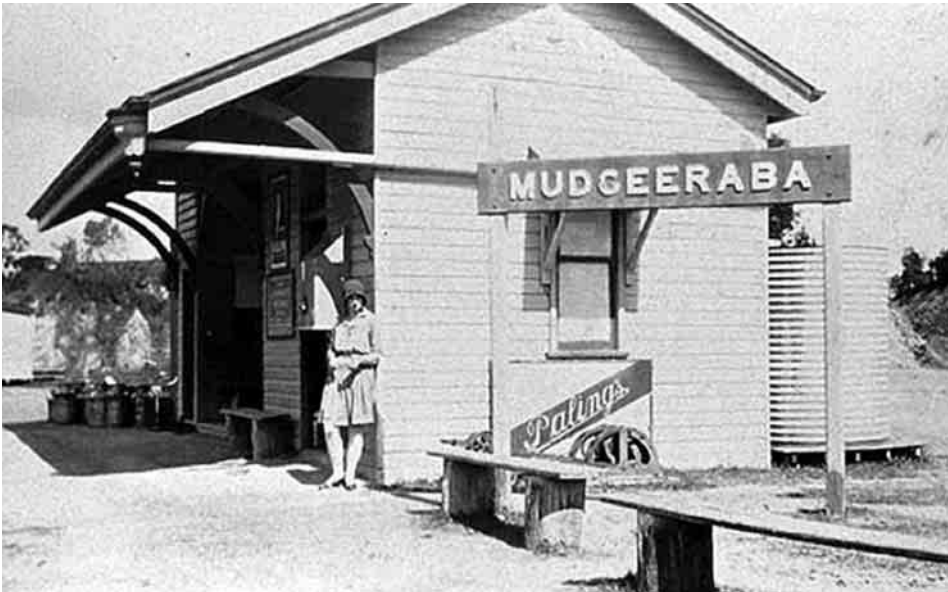
Parcels were sent by rail and collected at a railway station. When a subscriber finished with their parcel they would deliver it to the next family in the chain.

For a nominal fee of 2s 6d per year, country people were guaranteed four parcels, each with ten books and about six magazines and illustrated papers. This was considered adequate reading for three months. Parcels went from reader to reader instead of coming back to headquarters each time. If books were worn out or lost, a subscriber would correspond with headquarters and a supplementary parcel would be sent. That way, all parcels were kept to a high standard. A typical cloth-bound book would last two years, while paper-bound books had a shorter lifespan.