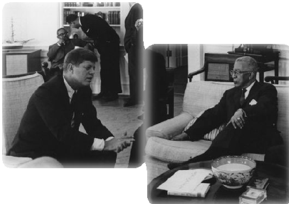
Rhodes visiting Kennedy's Oval Office in 1962.

“Second – class citizenship with all of its attendant evils must end. Unless men of substance and creative minds take positive action, move forward with alertness and stout hearts to remove this injustice, I fear that government of the people, by the people and for the people, will soon be endangered beyond repair.”