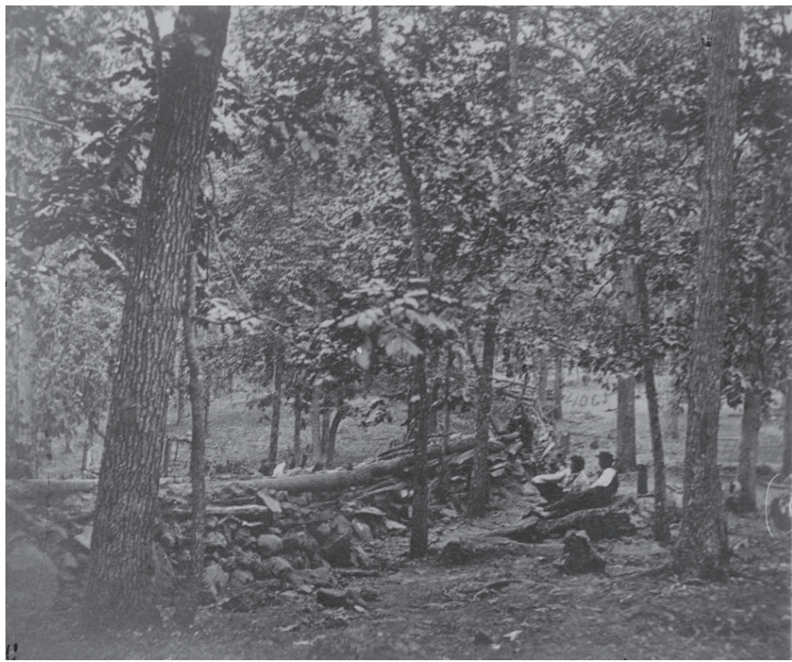
Breastworks on Culp's Hill