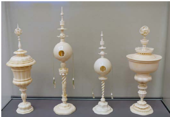
by Lorenz Zick, (1650), Bode Museum

The puzzle balls have often been referred to as concentric balls for Western consumers. The earliest known document of the puzzle balls in 1388 refers to the intricately crafted pieces as gui gong qui or “devils’ work balls”. However, puzzle balls from this time have not survived. 6 The craftsmanship of these works fascinated European tourists, which resulted in German craftsmen to create their own ivory puzzle balls. 7