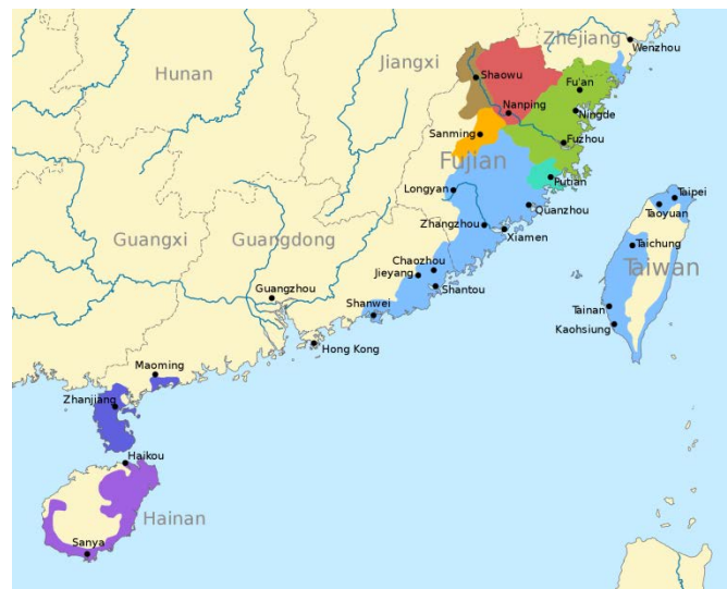
By Kanguole, Public Domain, via Wikipedia

Ivory was associated with knowledge or “scholarly taste” to many Europeans. 14 The precious material was often included in gifts for European leaders and aristocrats. Chinese and other European leaders displayed ivory to convey diplomatic relations between Eastern and Western nations. In 1685, Kangxi emperor received five pieces of ivory from Dutch diplomats to signify the relationship between both nations. 15 Ivory was favored by Chinese and European consumers because of the delicate appearance and luxurious quality of the material, but ivory also became deeply rooted in political and mercantile alliances.