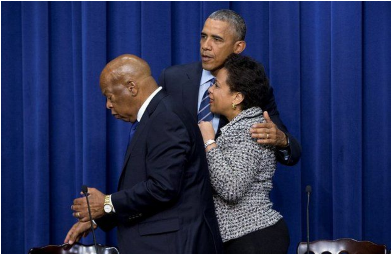
President Barack Obama embraces Attorney General Loretta Lynch, with Rep. John Lewis, D-Ga., after the president spoke in the South Court Auditorium in the Eisenhower Executive Office Building on the White House complex in Washington, Thursday, Aug. 6, 2015, on the 50th anniversary of the Voting Rights Act.