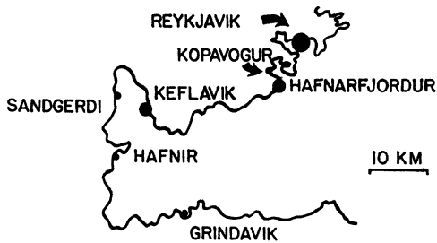
FIG. 1. Outline map of Iceland showing location of Surtsey in relation to the capital, Reykjavik, and the southern-most Vestmannaeyjar islands. FIG. 2. Inset of FIG. 1. The Reykjanes peninsula, showing the locations of major collecting sites.

tinually being added as new collections are made, there is no effort, in this report, to include precise site information or implications thereof. Where appropriate, some comments regarding collections are made.