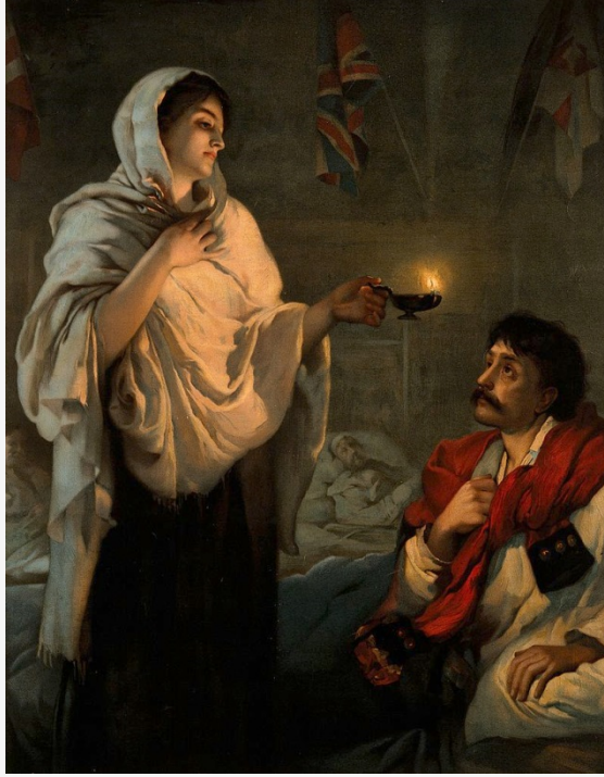
Lady with the Lamp , Henrietta Rae's 1891 imagining of Florence Nightingale's work in the Crimea

This was, in part, a result of the popularity of the Victorian icon Florence Nightingale and her legacy of sanitary hospital reform. Nightingale proved the inspiration for many American social reformers to volunteer their services during the Civil War. [1] Indeed, the Crimean War's legacy to modern military medicine is one of philanthropy and private initiative overcoming government negligence, a theme that is already apparent in the show.