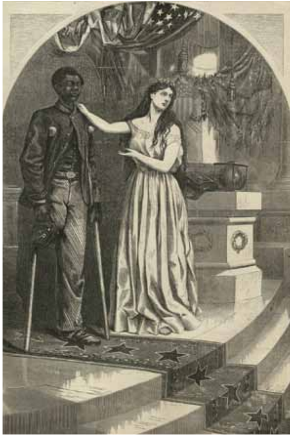
"FRANCHISE" THOMAS NAST HARPER'S WEEKLY August 5, 1865 Newsprint 52.5 x 40 cm Collection of Angelo Scarlato