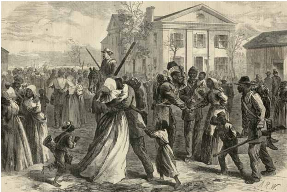
"MUSTERED OUT" ALFRED R. WAUD HARPER'S WEEKLY May 15, 1866 Newsprint 40.5 x 52.5 cm Collection of Angelo Scarlato