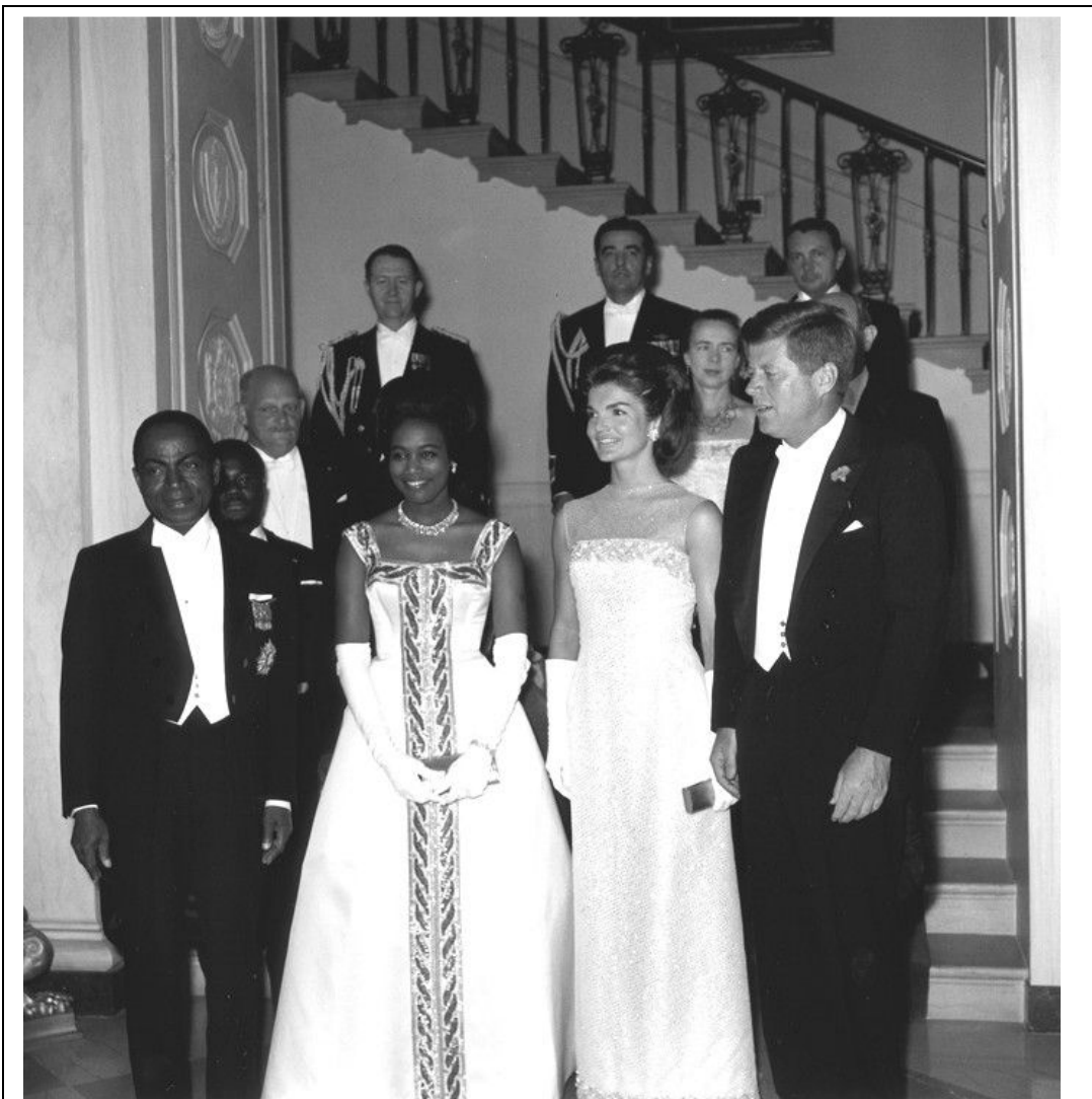
Figure 1 : Elegance as Diplomatic Tool

an American official went as far to say that Madame Houphouët-Boigny was “one of the world’s most beautiful and best dressed women.” Hervé Alphand—the French ambassador in Washington at the time of the visit—agreed with such assessment when he partially credited the media success of Le Vieux ’s trip to Marie-Therese’s eye-catching smile and graceful style. 48