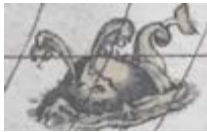
Ortelius, Map of the World Detail