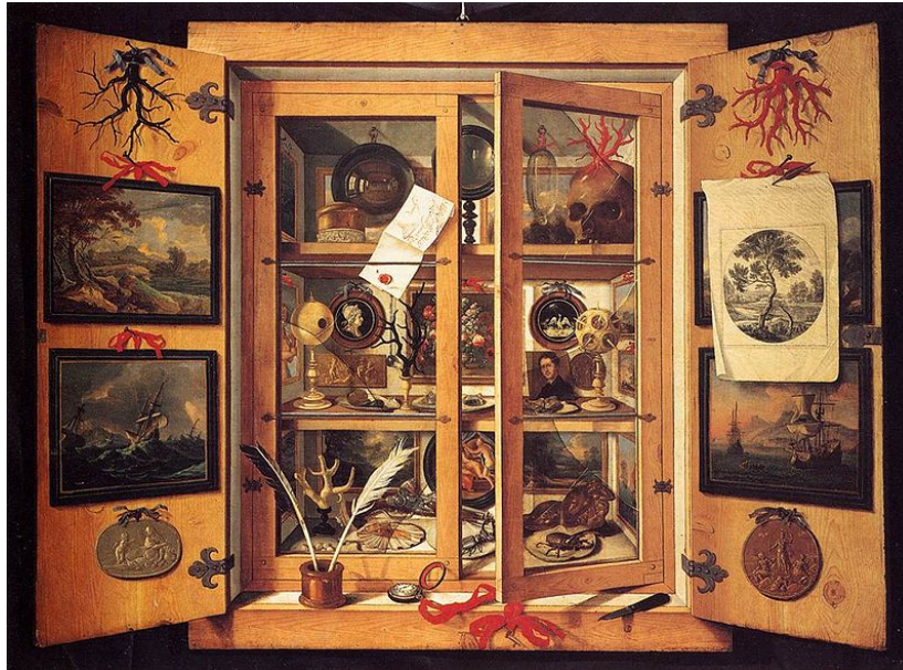
Wonder Cabinet, REMPS, Domenico. Scarabattolo, oil on canvas, late 1600s. Museo dell'Opificio delle Pietre Dure, Florence, Italy.

research. This is what globalization is all about!