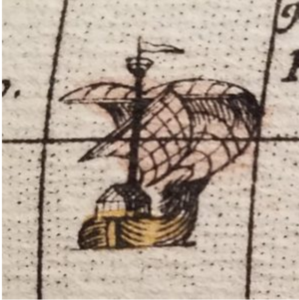
Ortelius, ship detail