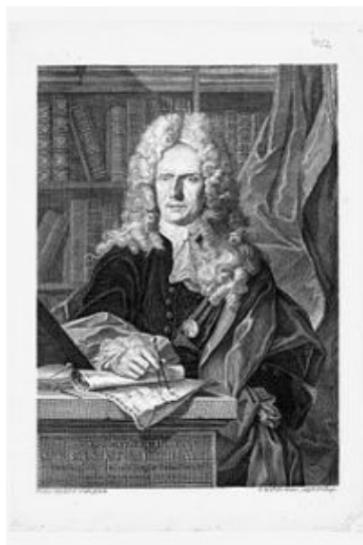
Johann Baptist Homann