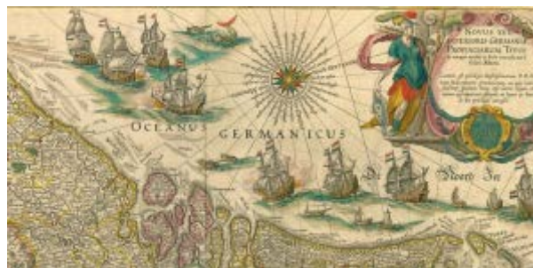
Detail of map by Willem Blaeu

find the same ships on several different maps designed during this time. In fact, ships were the leading ornamentation in Renaissance maps. Even as other types of illustrations decreased in popularity, the ship remained constant and even grew superior to all other illustrative decorations. It became a standard for all world maps to have them and was a mark of quality. “If indeed the illustrators were professionals whose task it was to represent the world in an engaging manner then even more the sheer entertainment value of the ships and other objects would have been central to their inclusion.” 8 Just as all art was taking on the quality of naturalism during this time period, these mini art details were evolving as well. It was very important that the images be as accurate and true to life as possible.