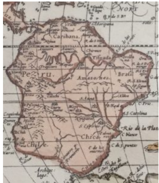
Detail of Map by Abraham Ortelius, South America

Neue tafel, yor alle liebhabers, und seefahrende personen is an engraving printed in Nuremberg in 1725, a year after Johann Baptist Homann's death. The text is in German, it is hand colored, and it's based on his original design. This piece is from the John H. W. Stuckenberg Map Collection kept in the Special Collections at Gettysburg College. The title means "A new plate presented to all seafaring people," and it includes 17 vignettes of the ribbing and planking, dry docks, and several nautical tools. The text at the bottom is a legend or key to the points placed on the central image of the ship. This map was in a few editions of Homann's 'Neuer Atlas...über die Gantze Welt' issued between 1712 and around 1730. 2 This particular ship is a naval ship, though it is placed in our exhibit because it resembles the merchant ships that were used to carry marvelous wonders across the world. Ships were quite literally the conduits of trade.