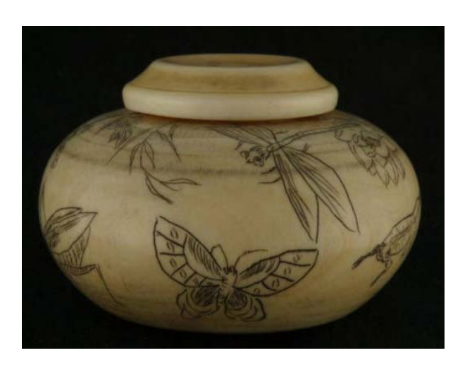
Carved ivory container from the Qing Dynasty. Black ink decorations depict a dragonfly, butterfly and cricket.

ASIANetwork is a consortium of 150 North American colleges striving to strengthen the role of Asian Studies within the framework of liberal arts education in order to prepare a new generation for a world in which Asian societies are playing more prominent roles.