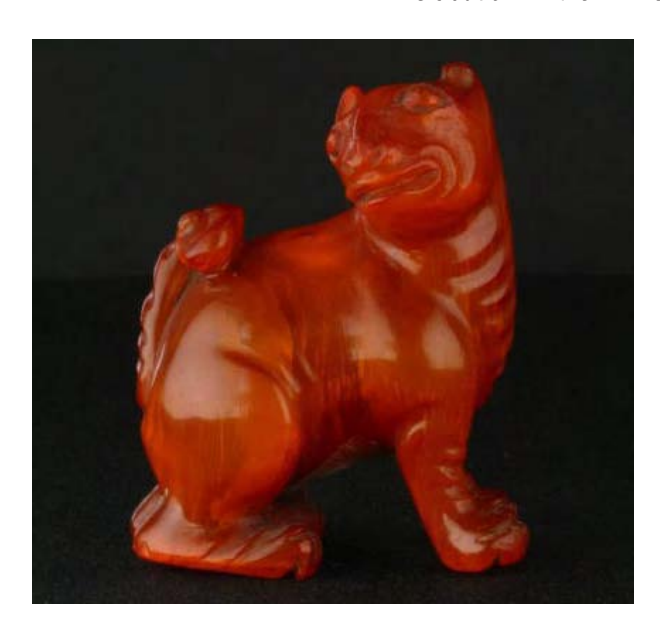
Carved figure of a Buddhist lion or Foo-dog from the Qing Dynasty. The carving was produced from a solid piece of water buffalo horn and stands at 5 1/2 centimeters.

Musselman Library has received a $1500 grant from ASIANetwork for a project that will make Asian art and material resources from numerous college collections available to faculty teaching Asian studies all over the country.