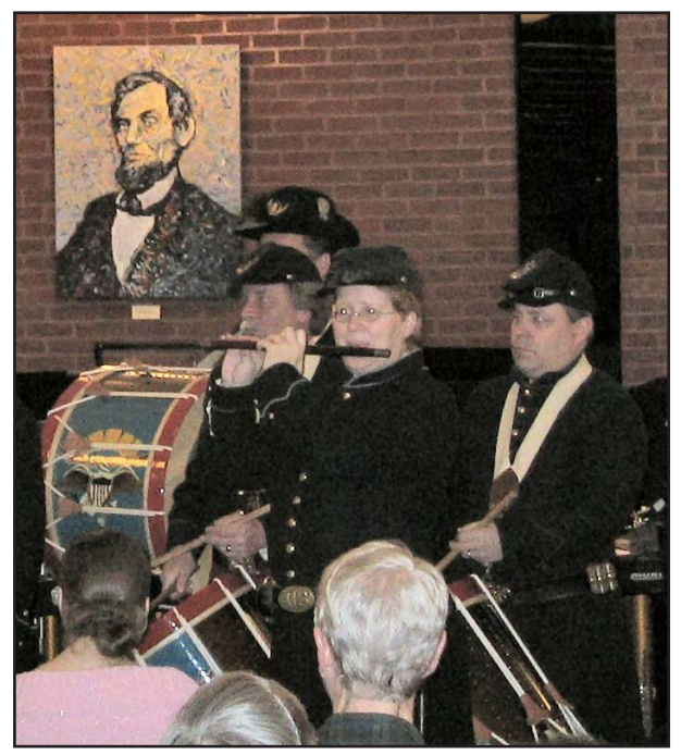
11th Pennsylvania Volunteer Infantry Fife & Drum Corps entertain in Library