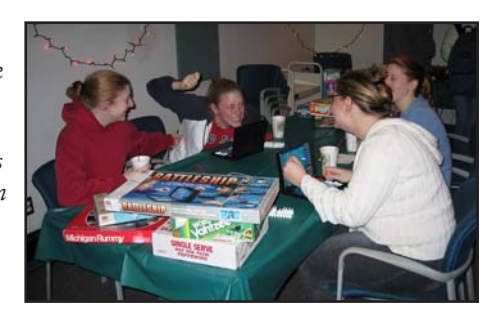
Students take a break from studying to enjoy snacks and games in the Library Media Theater.