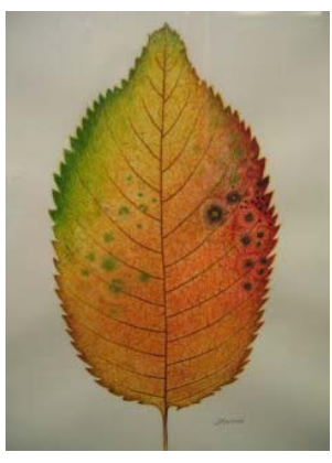
Watercolors by Jim Ramos—Two of many botanicals on display in the Library Browsing Room