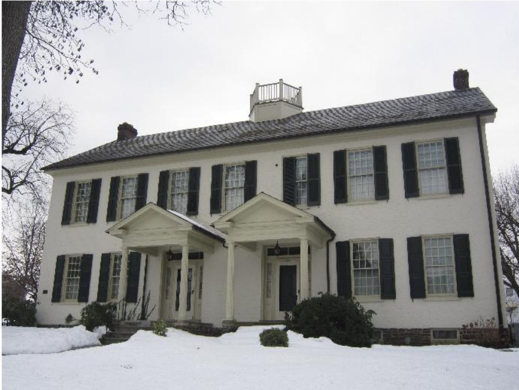
Original Pennsylvania College Building