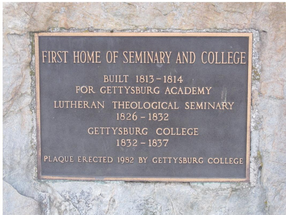
Plaque At The Building's Location