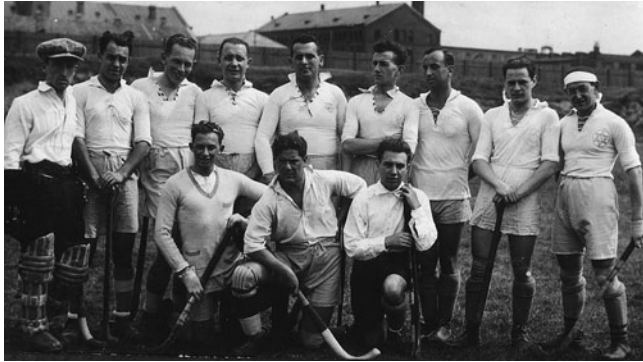
Photo 1. Men's Field Hockey Team.

for such activities as chess, which was also played competitively, and music. It organized dances and regular evenings of entertainment, many of which featured displays of athletic prowess. The club even created its own orchestra, which was reputed to be among the best amateur groups of its kind in the city and sponsored numerous balls said to be among the most sophisticated and sought-after in the city. Music, dancing, and other types of entertainment were an integral part of