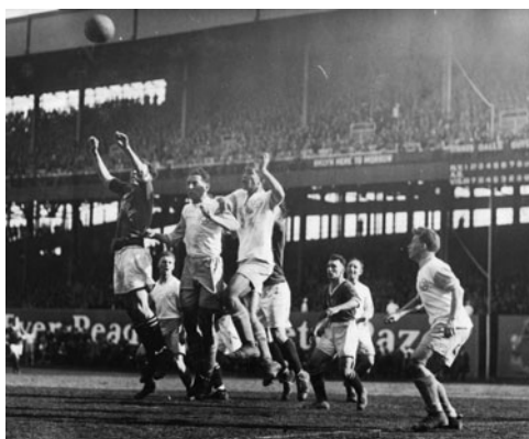
Photo 7. Hakoah Football Team in the United States.