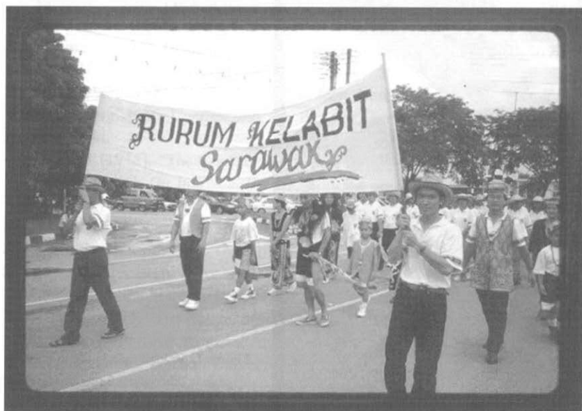
Figure 3. Representatives of the Kelabit association RKS marching in a parade in Miri, 1995.