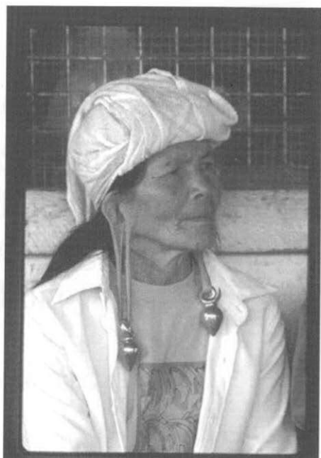
Figure 4. Kelabit woman at the Bario airport in the Kelabit Highland (photograph by Matthew Amster).