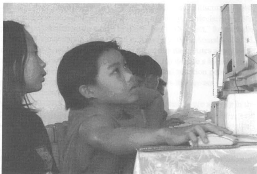
Figure 5. Children learning to use computers at the Bario school, 2004 (photograph by Matthew Amster from digital video by Jake Boritt).