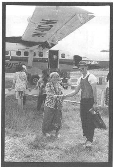
Figure 1. Kelabit man being greeted by his grandmother at the Bario airstrip upon his arrival from Miri.