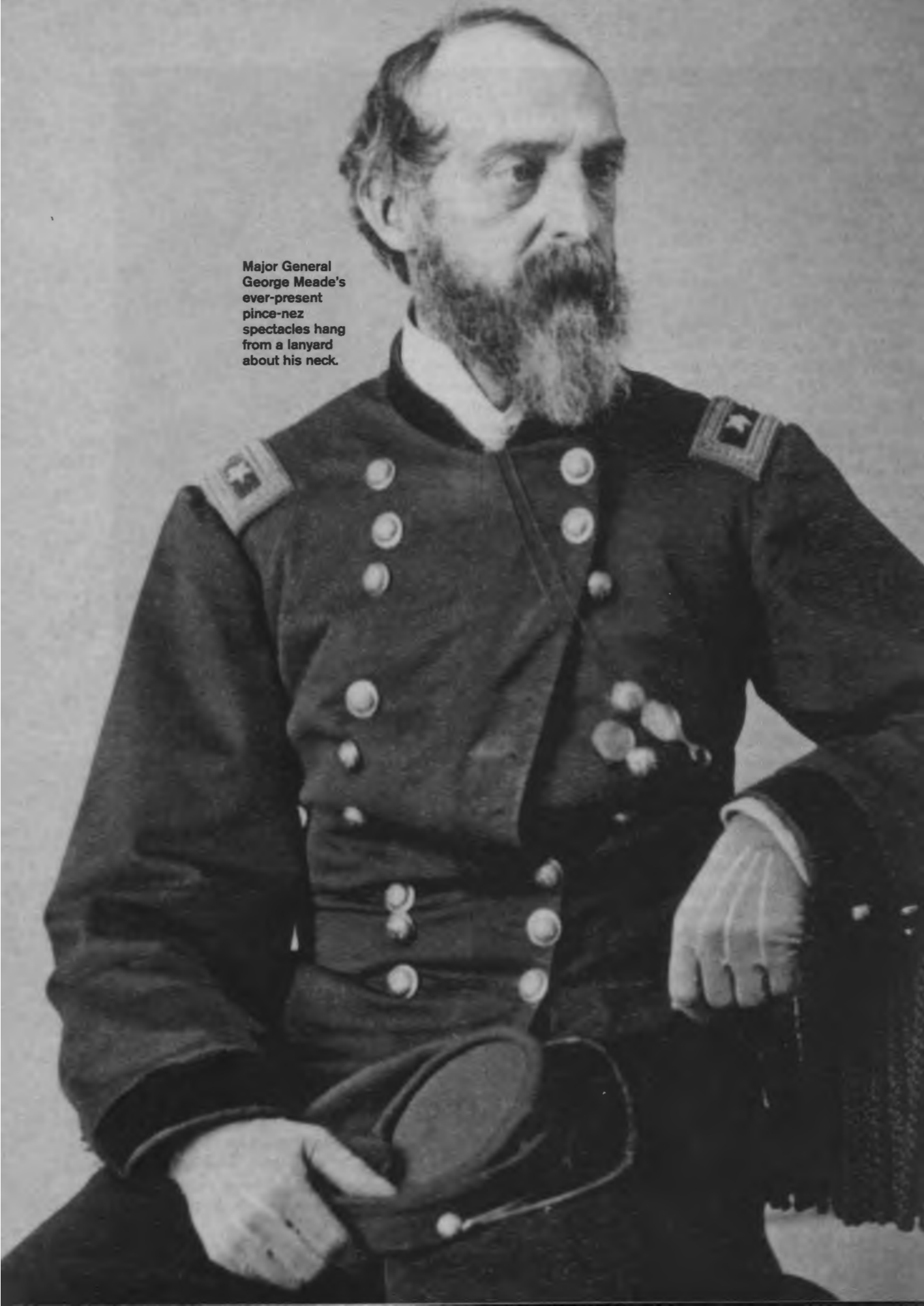
Major General George Meade's ever-present pince-nez spectacles hang from a lanyard about his neck.