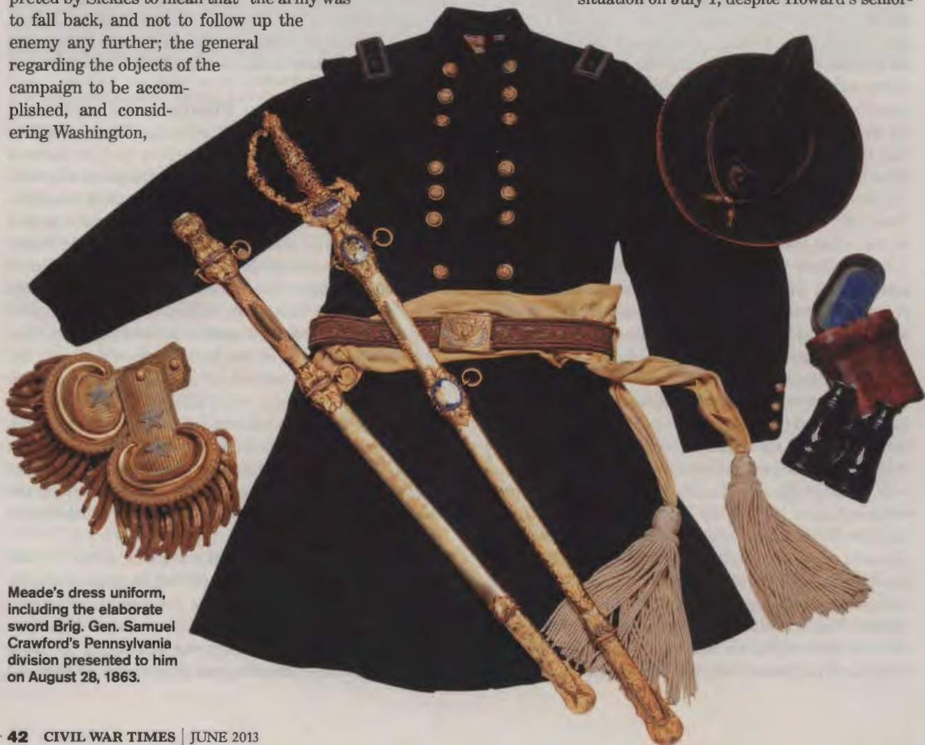
Meade’s dress uniform, including the elaborate sword Brig. Gen. Samuel Crawford’s Pennsylvania division presented to him on August 28, 1863.

From that moment, a long train of grievances and quarrels with Meade began to emerge from within the Army of the Potomac. Meade ruffled the feathers of Maj. Gen. Oliver O. Howard by sending Maj. Gen. Winfield Scott Hancock ahead to take charge of the Gettysburg situation on July 1, despite Howard’s senior-