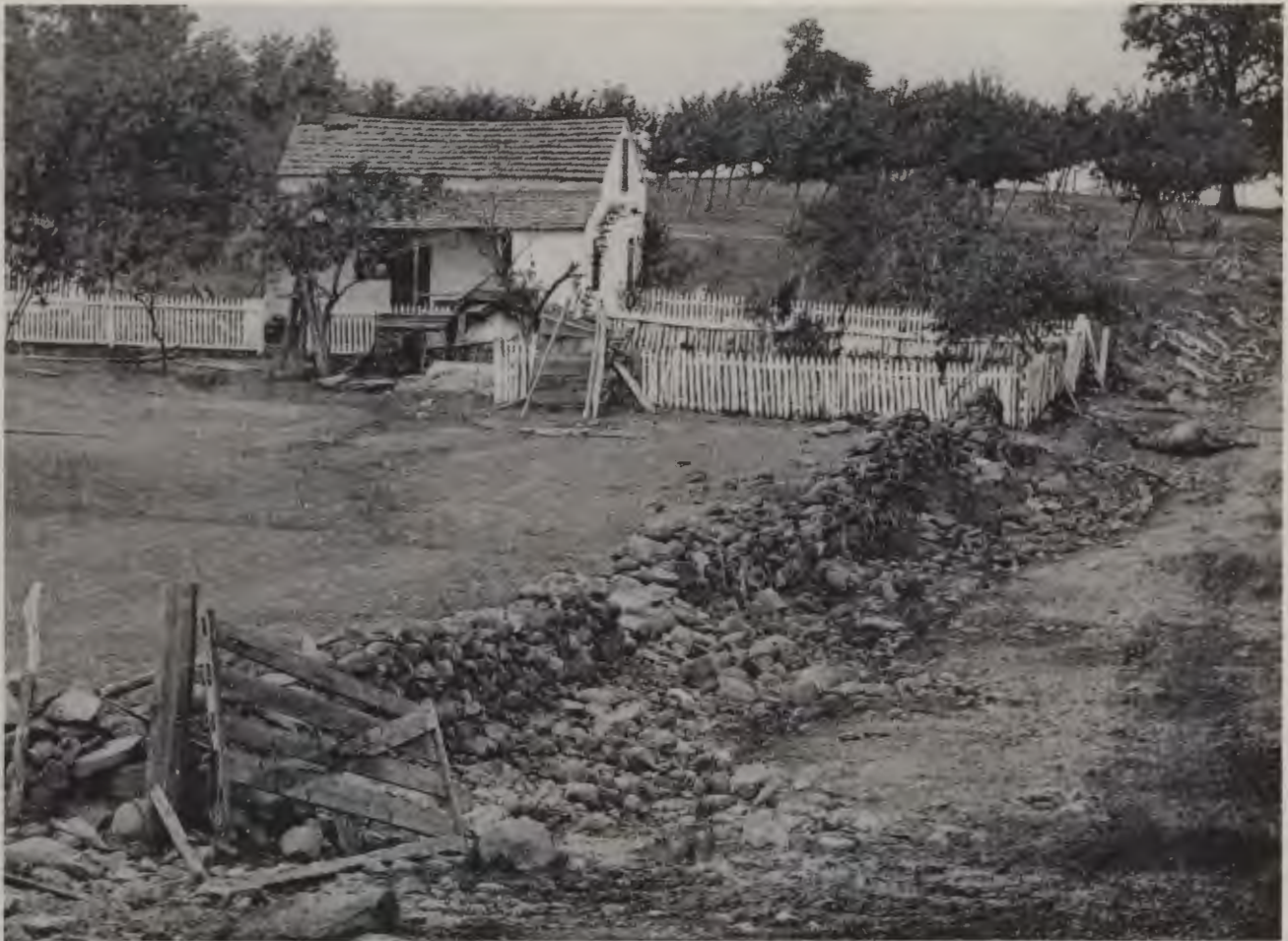
Fierce artillery fire before Pickett's Charge drove Meade from his headquarters, above, in the Widow Leister house along the Taneytown Road. This immediate post-battle image shows the destruction caused by the shellfire. A dead horse lies at the edge of the road.

our line" on July 4, "but they were very feebly made."