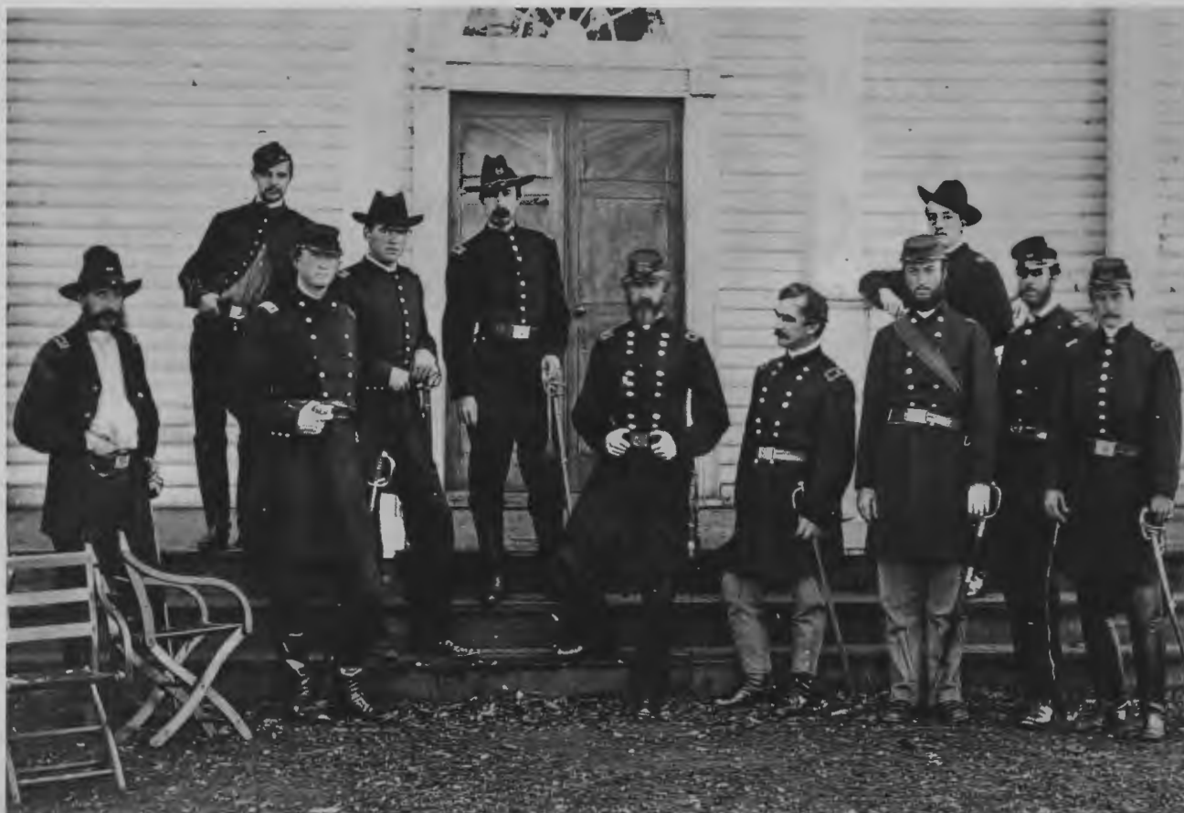
Meade stands in the center of his staff at his headquarters near Culpeper, Va., in September 1863. Major General Andrew A. Humphreys, at Meade's left, led a III Corps division at Gettysburg but became Meade's chief of staff following the battle.