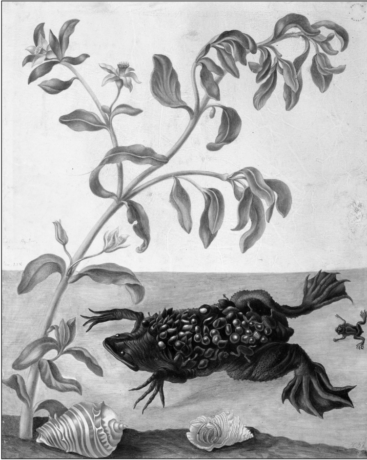
Fig. 3. Pipa pipa female with young by Maria Sibylla Merian. Pen and ink with watercolor and body-color on vellum. The plant ( Sesuvium portulacastrum ), mollusk shells and crab are saltwater organisms, and probably were added for decorative effect. This image is the basis of Plate 59 in Metamorphosis (Merian 1705). See also the cover.

1686). Leeuwenhoek made a detailed drawing of a tadpole and described aspects of metamorphosis 4 , but unlike Jacobaeus he did not depict multiple stages of development. Jan Swammerdam used a microscope to assist in making highly detailed drawings of eggs, larvae and adult frogs, but these images were not published until decades after his death, and well after Merian's 1705 Metamorphosis (Swammerdam, 1737–38). Merian's depictions of anuran larvae and adults were different from those of her predecessors in several ways. Notably, she provided color images, she portrayed the complete life cycle in one