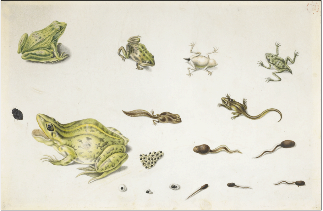
Fig. 1. Frog metamorphosis as depicted by Merian. Pen and ink with watercolor and bodycolor on vellum, 23 by 32 cm. This undated image from the British Museum prints and drawings collection was copied by Merian from entries made in her study journal in 1686. The frogs and tadpoles are most likely Rana lessonae , Rana ridibunda , or their hybrid.

some spiders and vertebrates (Merian et al., 1980–1982). 2 She had intended a longer sojourn in Surinam, but illness forced her to return to Amsterdam, where she worked for three more years to complete her most famous book, Metamorphosis insectorum surinamensium (Merian, 1705). Buyers could choose between an uncolored edition and one that was hand-colored by Merian, possibly assisted by her daughters (Reitsma, 2008). Merian was skillful in her use of color and usually worked from fresh rather than preserved specimens, so her images provide a very accurate depiction of the pigmentation of organisms (Merian et al., 1980–1982).