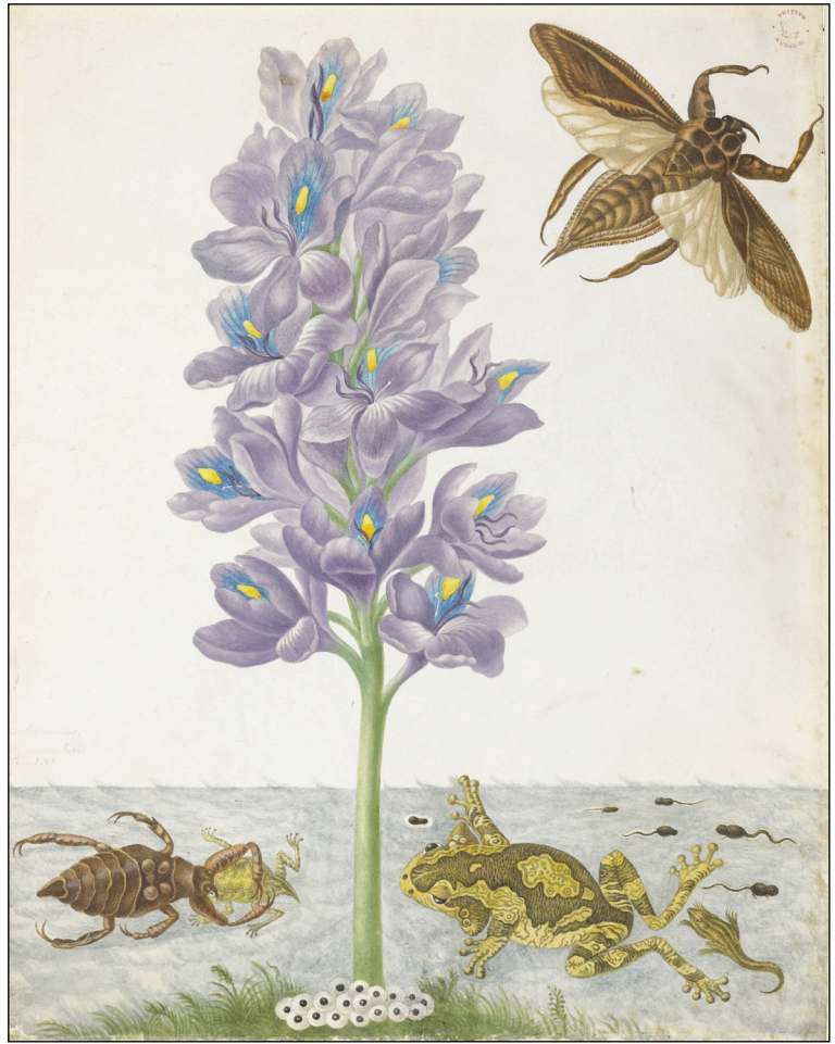
Fig. 2. Trachycephalus venulosus with tadpoles and eggs (circa 1704). Maria Sibylla Merian. Pen and ink with watercolor and bodycolor on vellum. The water hyacinth ( Eichhornia crassipes ) and the large predatory waterbug (nymph and adult, Lethocerus sp.) could occur in the same habitat. This image is the basis of Plate 56 in Metamorphosis (Merian 1705).

form within the single image. The Pipa pipa young are more accurately portrayed than those of Trachycephalus venulosus . The anomalous hermit crab and the lack of detail in the forefeet do not detract from the information conveyed by Merian's representation of this unusual form of amphibian reproduction. Merian's watercolors of Pipa pipa at Windsor and the British Museum also reveal something absent in the printed books, in that she tinted the eggs with gold to indicate more accurately their true color. The cost of doing this in the editions of Metamorphosis that were hand colored may have been prohibitive, so perhaps she sacrificed some color accuracy as a business decision. This species was named by Linnaeus (Linnaeus, 1758) based among others on the four images in Seba's Thesaurus (Seba, 1734, Plate 77).