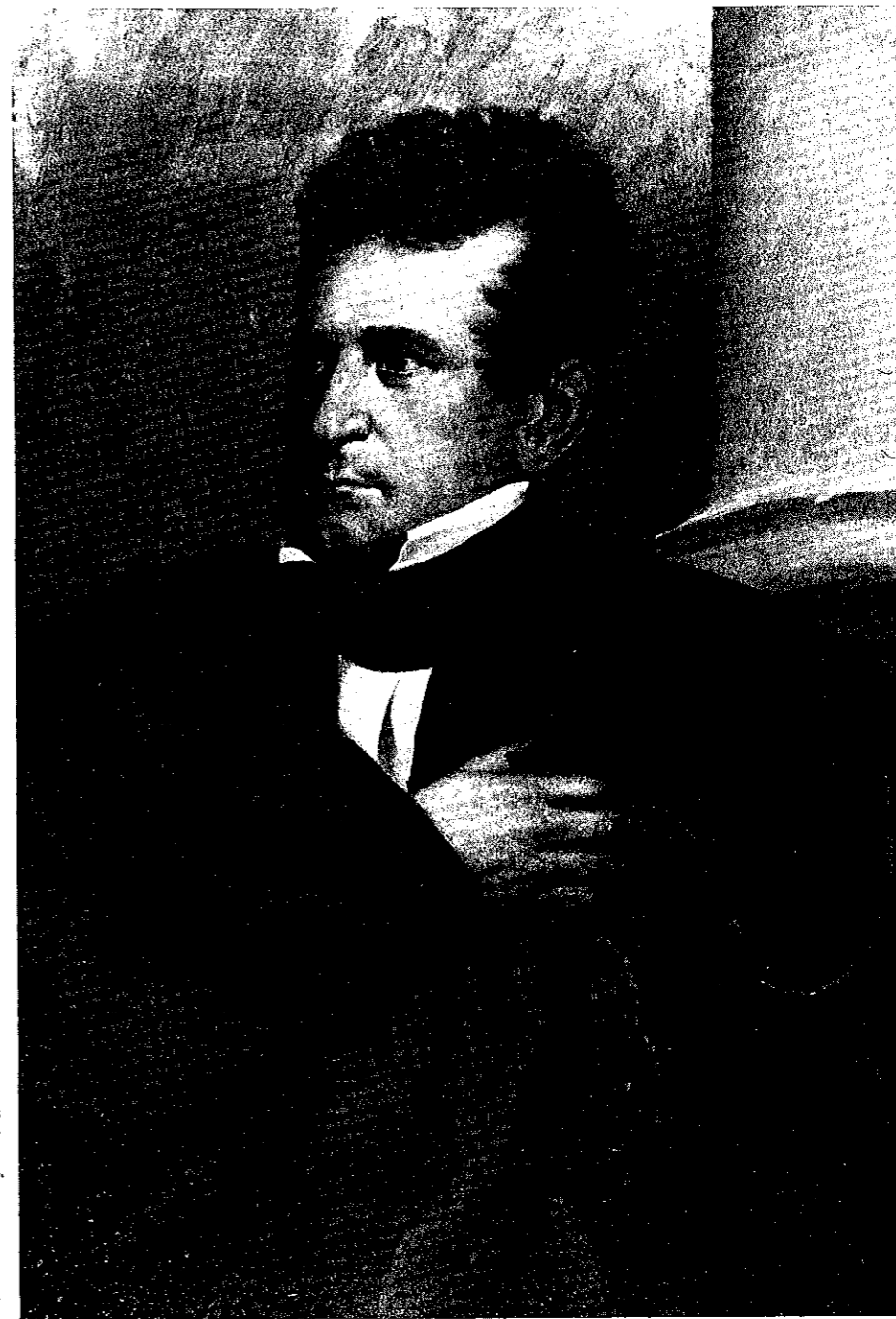
U.S. Naval History Museum