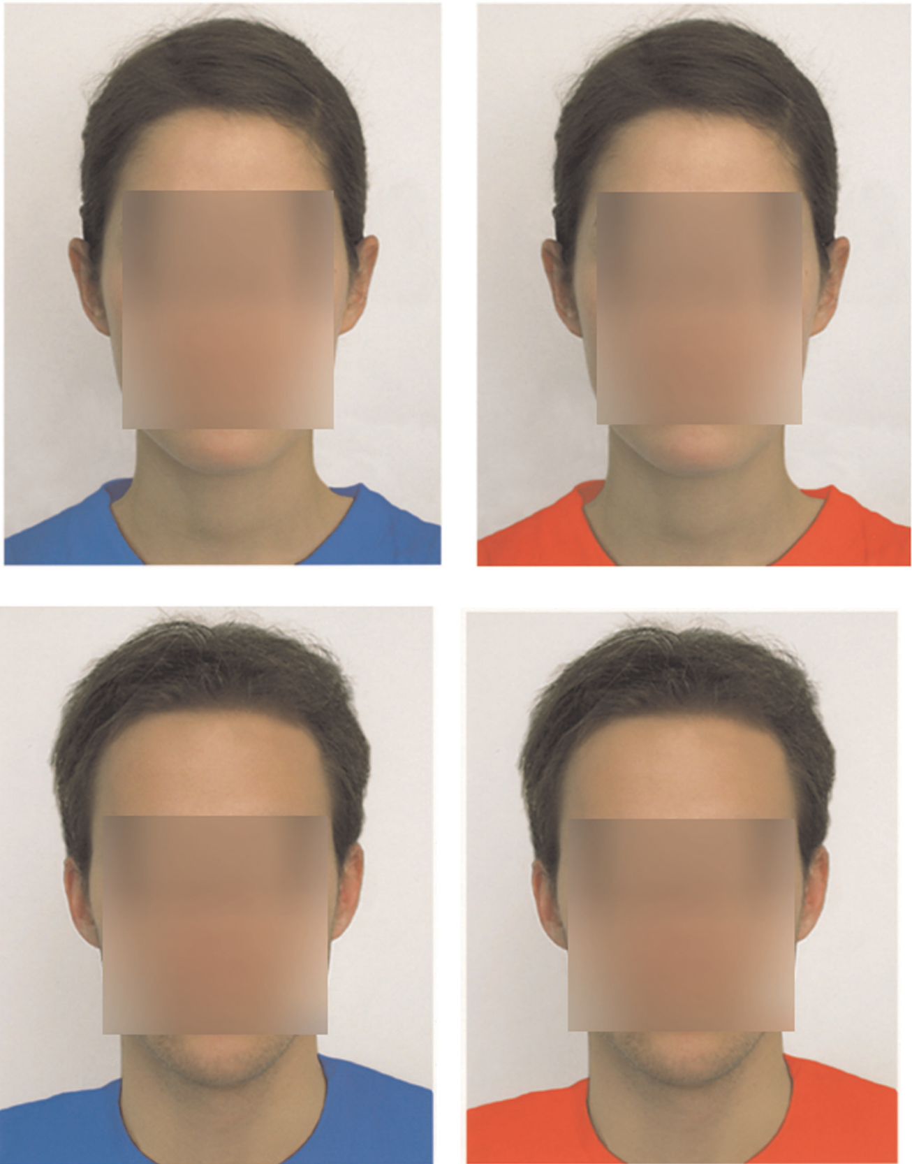
Figure 1. Pictures of “Jackie” and “Jack” in Blue and Red. The faces were intact in the experiment, but are blurred here to protect privacy. doi:10.1371/journal.pone.0040333.g001