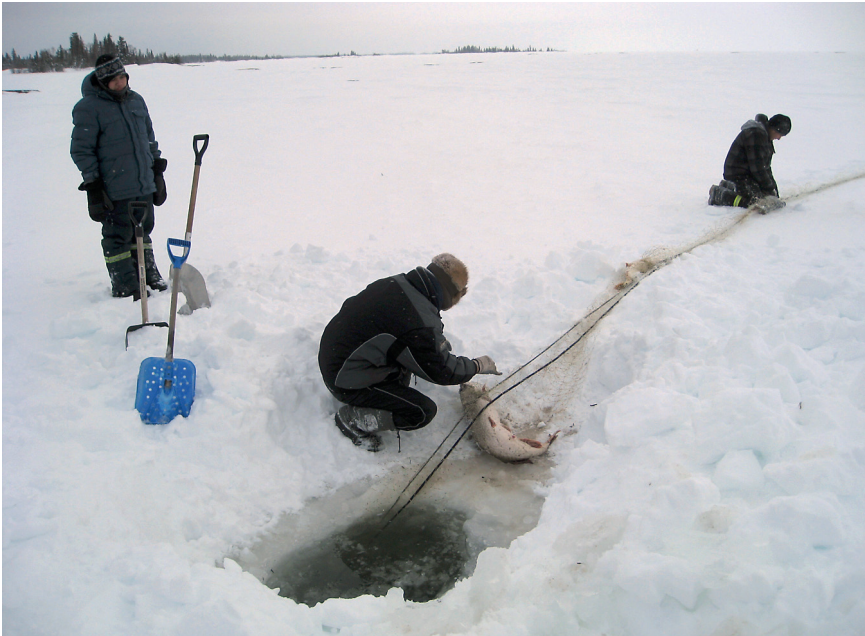
An elder demonstrates how to check the fish net on Great Slave Lake, Northwest Territories, Canada.

The Tłı̨chǫ Dene live in their ancestral homeland north of Yellowknife and Great Slave Lake, and south of Great Bear Lake, in the Northwest Territories, Canada. Hunter-gatherers, the the Dene emphasize hunting as wild crops are less abundant in the north: they hunt big game like caribou and moose; and small game that is trapped, including rabbit, muskrat, beaver; ducks and geese; and lots of fish. The Tłı̨chǫ were in an isolated pocket, without contact with Europeans, longer than any other indigenous people in North America (Helm 2000). They first met Catholic Oblate missionaries from France and Belgium in the 1860s. Even after contact, the Tłı̨chǫ maintained nomadic lifestyles of trapping, fishing, and following migrating game for another hundred years until the Canadian government established settled communities in the 1960s. Most Dene peoples still maintain hunting and fishing subsistence lifestyles. The Tłı̨chǫ in particular maintain diets high in traditional food, but this is changing between generations (Tłı̨chǫ 2012). I have sat at meals where elders in the house eat only caribou, moose, and fish, while the youth eat store-bought meats and processed foods.