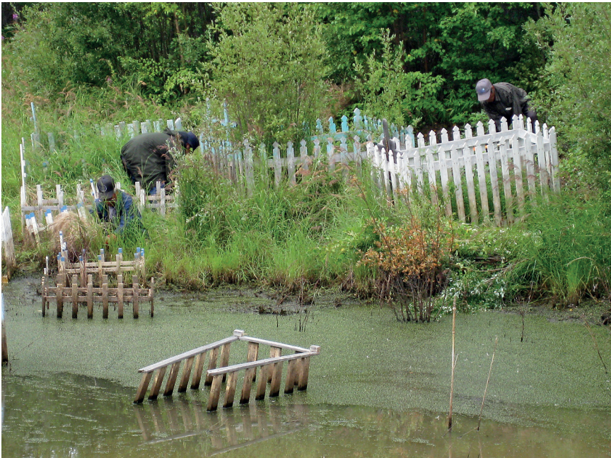
Individuals clearing grave sites for the ancestors, dòkw'òò whetòò, at a cemetery in the bush.