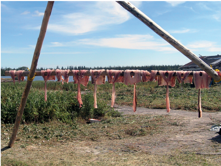
Making dried fish.

Traditional foods are served at most weddings, funerals, and community feasts, such as caribou and fish, along with naturalized foods that still appeal to elders such as bannock, oranges, hot dogs, hard boiled eggs, noodle salad with canned meat, a rice pudding called kwet'sa , canned fruit sometimes poured over kwet'sa , and coffee and tea. Smaller family feasts may involve traditional and naturalized foods, and others more typical of southern Canadian tastes: baked ham or turkey, grilled hamburgers, mashed potatoes, beer, and if one is returning from the city of Yellowknife, Kentucky Fried Chicken. Andrews (2011: 222) states that traditionally men served food to family members sitting on the