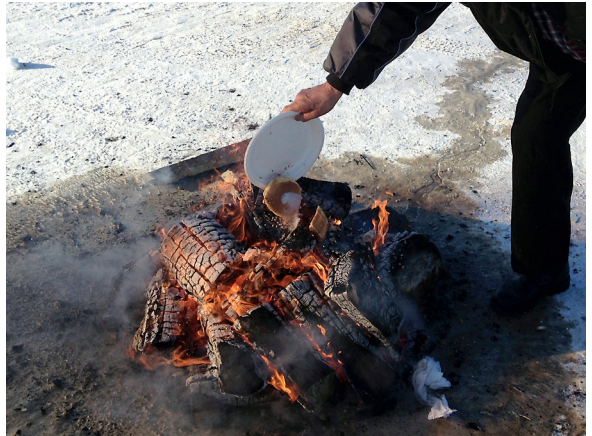
A Tłjchq individual performs kq ghàts'èèdi - feeding the fire.

The Dene offer ghàts'èèdi to ancestors through kq ghàts'èèdi , or 'feeding the fire' (see Legat 2012: 92–5). Ancestors are deceased kin who continue to live on in the social world and in the domestic domain, and whom Miguel Astor-Aguilera states (2010: 164), 'one should take care of... so they assist when needed and do not bother when not needed'. Not all the deceased are ancestors, but the ones who remain in