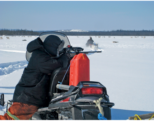
A caribou hunt.