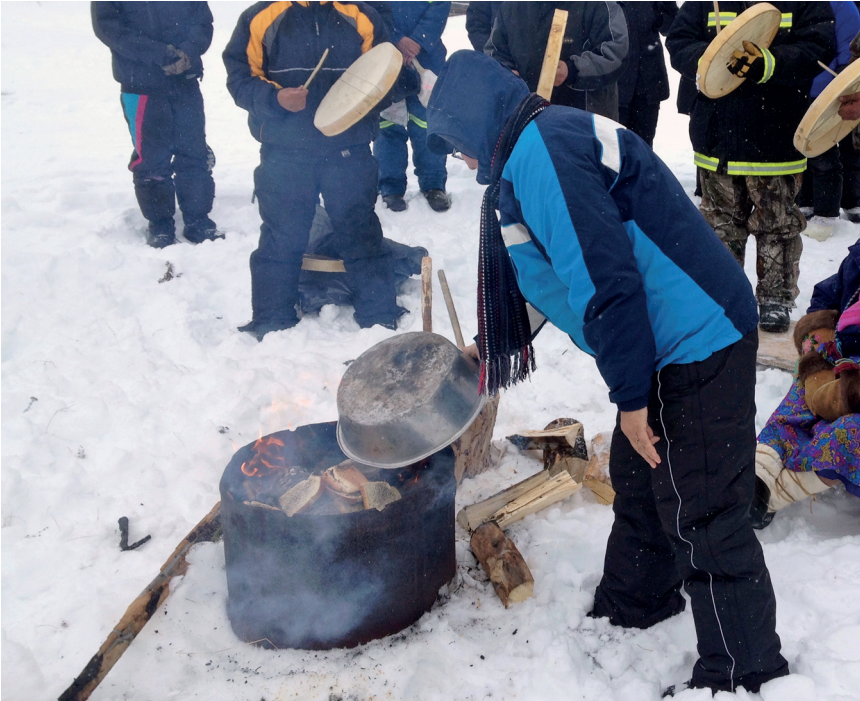
A woman pours bread and other foods into the fire at a kò ghàts'eèdi ceremony.

foodways stages. Reciprocity eases the tension of relying on the other for sustenance, and is refocused on in moments of crisis such as the current caribou population decline.