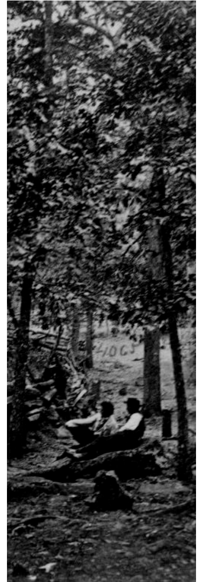
You can almost see the picnic in the shade trees if you wander Culp's Hill long enough.