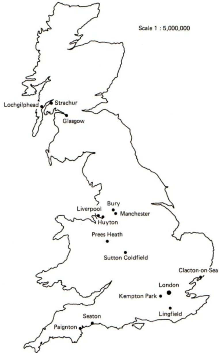
MAP 1 Map showing the sites of the internment-camps in Great Britain