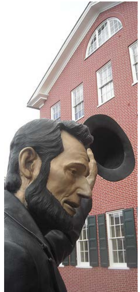
Perhaps Lincoln left behind some sour grapes at the Wills House in 1863.