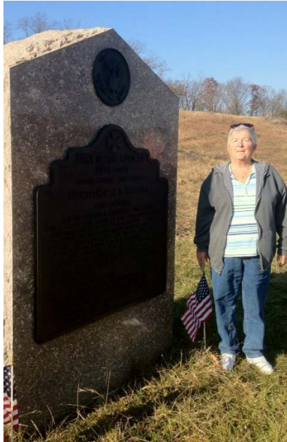
Mom with the 14th U.S. Regulars monument, November 19th, 2012.

I streaked down the highway to Durham, to Duke University Hospital. I held my Mom's cold hand, whispered, "I love you," in her ears. She was sick. It was bad.