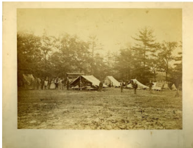
“Scenes from the Battle-Field at Gettysburg, PA”

Taken approximately three weeks following the famed Battle of Gettysburg, this picture depicts a Civil War Field Hospital.