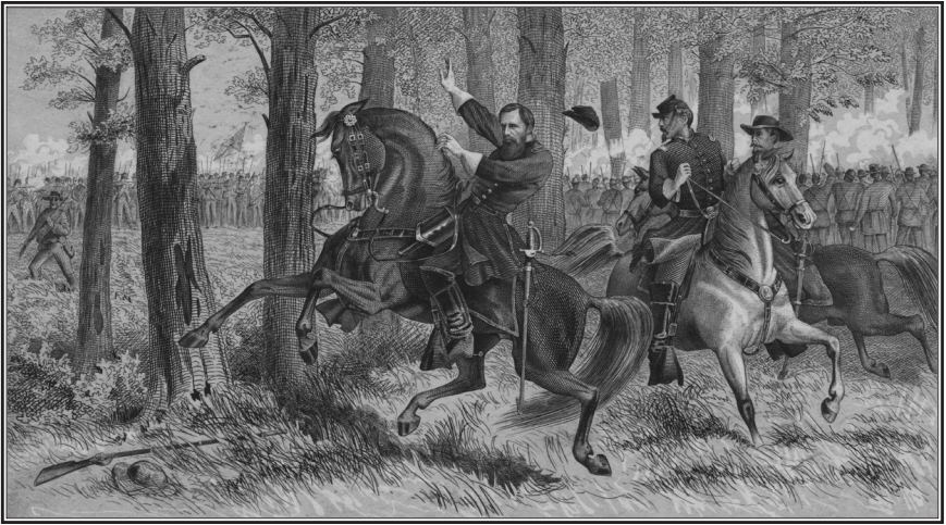
Death of Gen. John Reynolds in Herbst Woods.

after we had been in some time there was word came that our Army was Retreating and the Rebs were taking possession of the Town which caused great excitement.