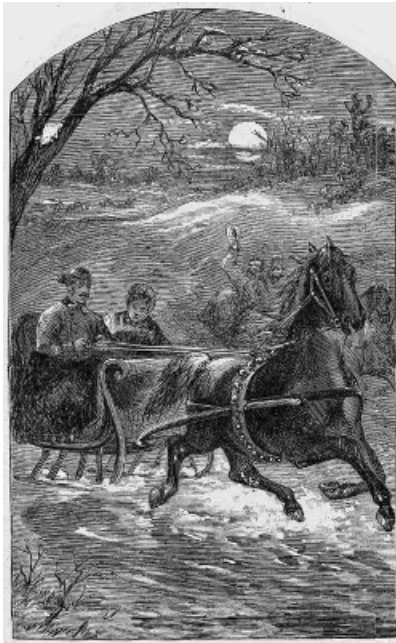
Sleighbg, as depicted in Harpers Weekly in late 1864.

"Snow and sleighing," are, a correspondent in the Franklin Repository opined in January of 1864, "delightful words to the young, and foolish, and careless." Still, the elder correspondent was keen to, "thank time! we have outgrown such follies."