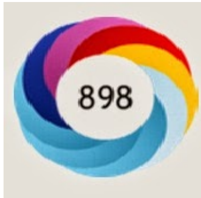
The Almetric donut of scholarly awesome-ness

A new research tool that goes hand in hand with open access is called 'altmetrics.' There are number of ways publishers measure a journals impact upon the academic community, which have not been updated to reflect the changing mediums of information.