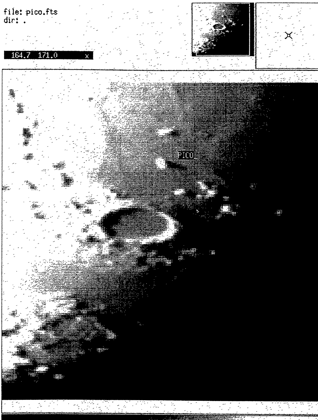
Figure 2. Image of the moon used for the determination of the heights of lunar mountains. The shadow of Pico is shown. The image was taken by Michael B. Hayden on November 3, 1993, at 23:30 UTC, using a Lynxx CCD camera attached to a Celestron C-8 telescope.