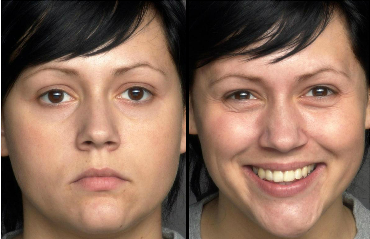
Figure 1. Example stimuli from Study 2, illustrating the two smile conditions [neutral, smiling].

Participants viewed each identity once, but only one of the two smile conditions. For example, any single participant viewed only one of the above two images.