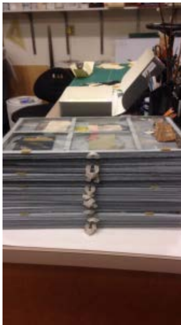
Dance cards rehousing solution. 12 Trays in total!