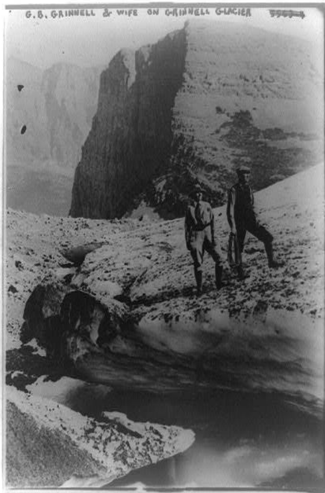
George Bird Grinnell and his wife on Grinnell Glacier, 14 March 1925