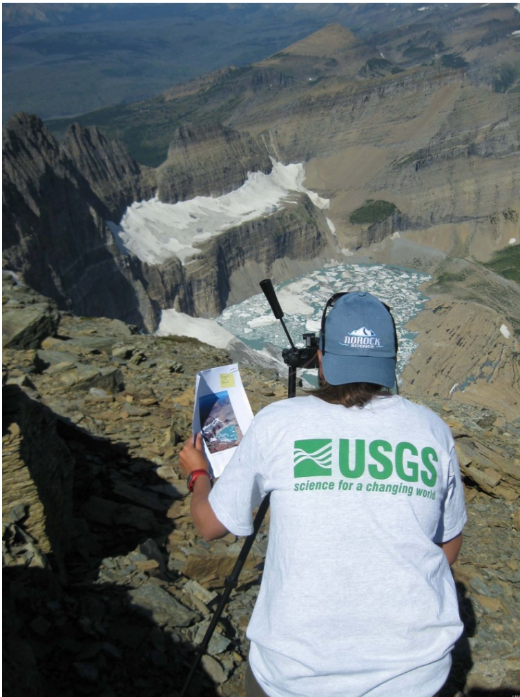
Visually documenting Grinnell glacier as part of the repeat photography project in 2010

Historical photographs of glaciers began to be systematically used in the United States Geological Survey's (USGS) collaboration with GNP in 1997. They provide a visual representation of glacier retreat. When combined with other types of geological information, such as USGS mapping and fieldwork, they help pinpoint the changing park landscape.