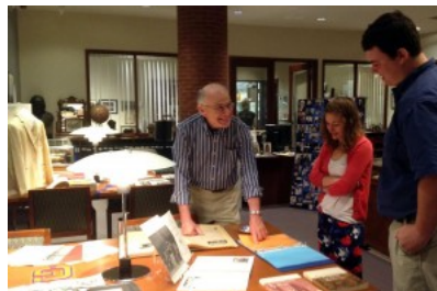
Our first day